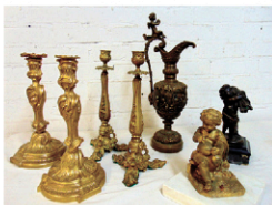
Large selection of bronze