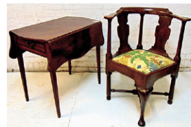
Antique Furnites, plenty more available