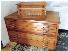
Flat File, Spool Cabinet