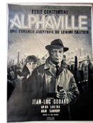
One of many large linen backed Vintage Posters

Walkaround sale with No Internet bidding. Absentee and phone bidding available.