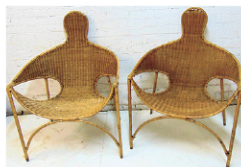
Lots of Mid Century