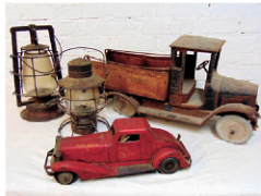
Vintage cars, Lanterns