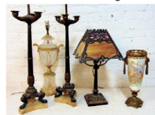
Selection lighting, good smalls