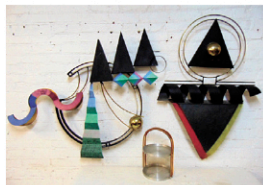
Curtis Jere, Russel Wright