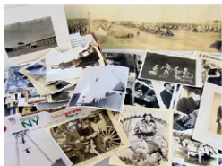
Large selection photographs