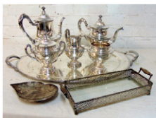
Lots of Silver Plate & Sterling