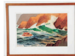
Lot #260, James Edward Fitzgerald, "Oregon Coast", watercolor, signed, 15" x 20 1/2", framed 18 3/8" x 24 1/2"