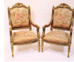
Lot #292, Pair of 19th century French armchairs having tapestry upholstery, 43" H x 24" x 25 1/2"