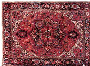
Lot #547, 19th century Persian Serapi rug, 12' 3" x 10'. Some border wear.