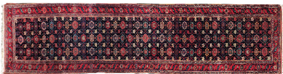
Lot #501, 19th century Persian Bidjar runner, 17' 8" x 3' 4"