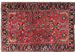
Lot #542, 19th century Persian Heriz rug, 11' 2" x 7' 7"