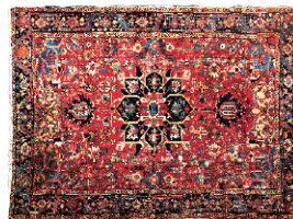
Lot #558, 19th century Persian Heriz rug, 11' 10" x 8' 5"