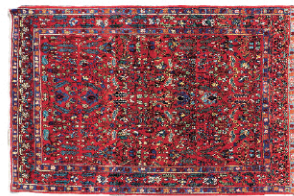
Lot #527, Antique Persian Bidjar rug, 10' 11" x 7' 5"