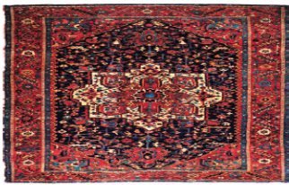
Lot #504, Antique Persian Heriz/Serapi rug, 15' 3" x 9' 5"

Preview hours Monday - Friday, Oct 16-20, 9AM-5PM. Saturday and Sunday at 9AM. Preview is open while the auction is live.