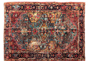
Lot #533, 19th century Persian Heriz rug, 10' 9" x 7' 11". Some wear.