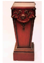
Lot #283, Large classical mahogany pedestal, 40" H x 15 1/2" x 21"