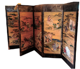
Lot #234, 19th century Japanese 6-panel screen, hand-painted on paper, with a silk mat and wooden frame. 67 1/2" H x 144" W.