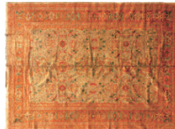
Lot #568, Semi-antique Oushak rug, 11' 4" x 8' 9"