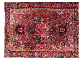
Lot #584, Late 19th century Persian Heriz rug, 13' 3" x 9' 6"