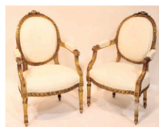
Lot #309, Pair of 19th century French giltwood oval-back armchairs, 37" H x 24" x 21"