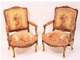
Lot #279, Pair of late 19th century French armchairs having tapestry upholstery, 43" H x 24" x 28"