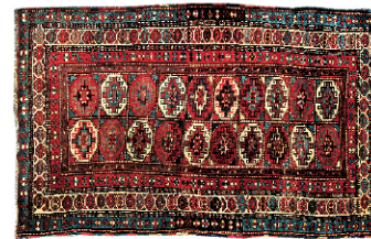
Lot #537, 19th century Caucasian Kuba rug, 8' x 4'.