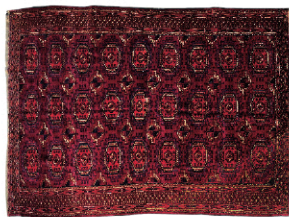
Lot #505, Late 19th century Turkmenistan Tekke rug with silk, 4' 9" x 7' 7"