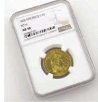
Lot #44A, 1806 Round 6 $5 gold half eagle coin, draped bust, high grade.