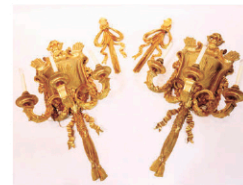
Lot #261, Important pair of early 19th century French ormolu bronze sconces, 48" H x 25" W x 15" D.