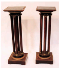
Lot #306, Pair of classical carved mahogany marble-top pedestals, 44 1/2" H x 12 1/2" x 12 1/2"