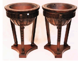
Lot #123, Pair of classical mahogany planters having copper liner, 35" H x 24" x 20"