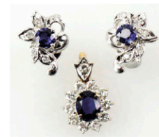
Lot #12, 18k, diamond and sapphire suite, to include bicolor gold pendant and white gold earrings, pendant 3/4" H x 1/2" W.