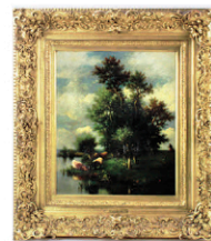
Lot #262, Jules Louis Dupre, pastoral landscape with cattle, oil on canvas, signed, 18 1/4" x 15 1/4", framed 25" x 28"