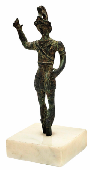
Roman Bronze Warrior, HT 6"