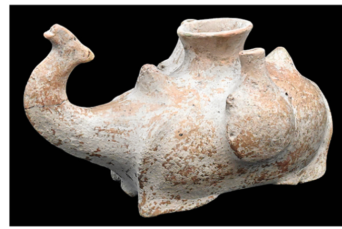
Parthian Pottery, HT 9"