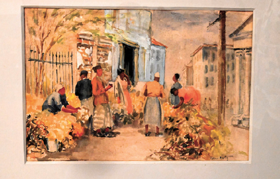
Alfred Hutty watercolor, 14 1/2" x 21"