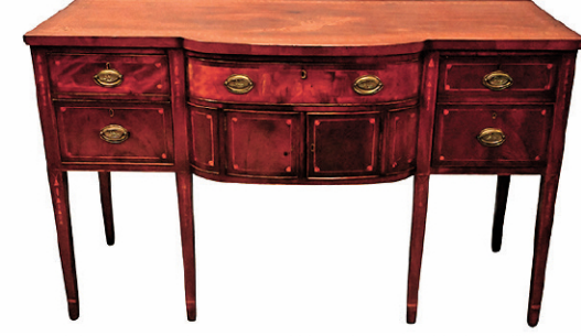
Mahogany Federal Inlaid, Maryland, LG 64'