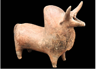
Iranian Pottery, HT 16", Part of Collection