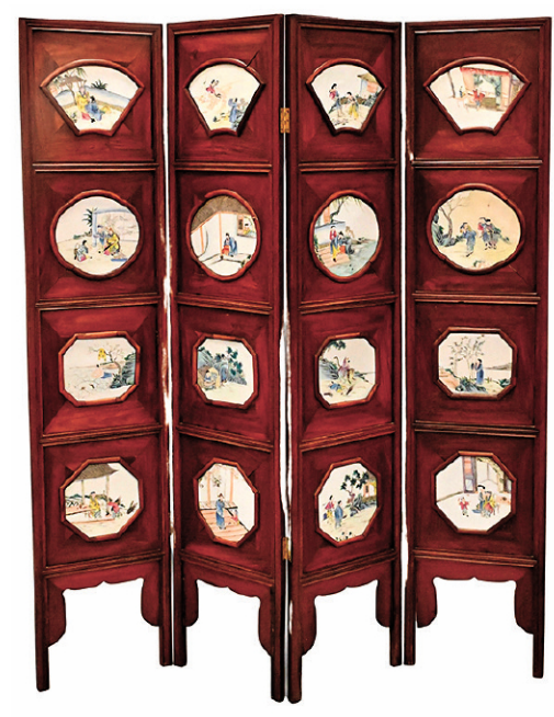
Chinese, LG 52", HT 73"