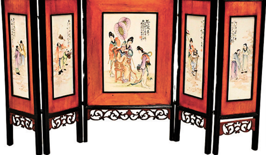
Chinese, LG 8"