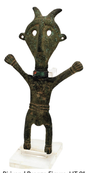
Pirivend Bronze Figure, HT 8"