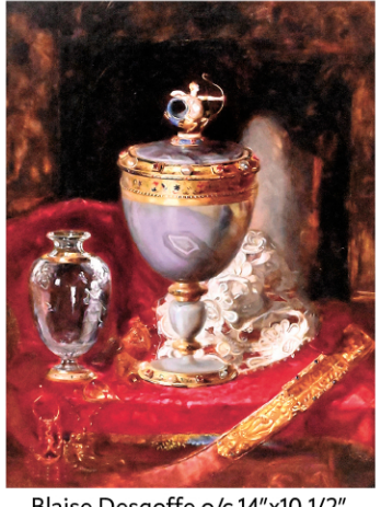
Blaise Desgoffe o/c 14"x10 1/2"