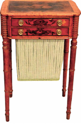
Federal painted & figured maple