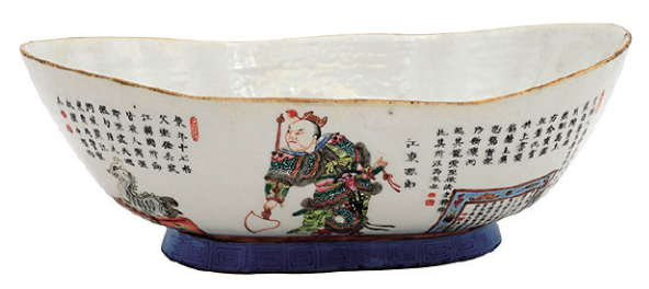
LG 10", HT 3"

Preview Times: Thursday Oct. 19тн from 12:00рм – 6:30рм | Friday Oct. 20тн from 12:00рм – 5:00рм | Saturday Oct. 21st from 9ам – 10ам