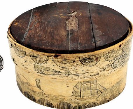
Scrimshaw White bone Ditty Box, DIA 8"