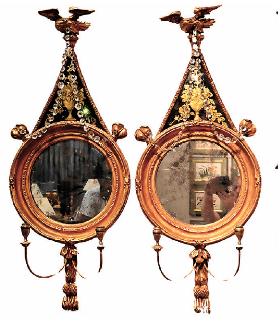
Pair of Girandole Mirrors, HT 42"