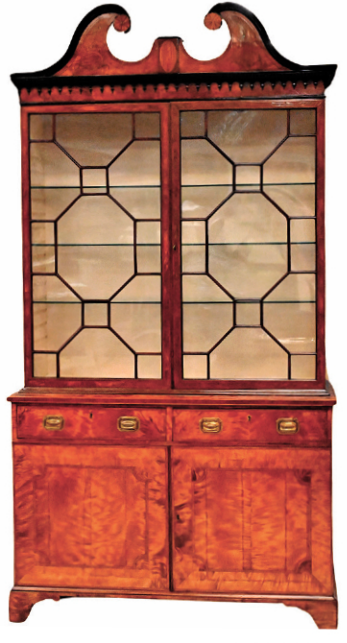
George III Satinwood, HT 92"