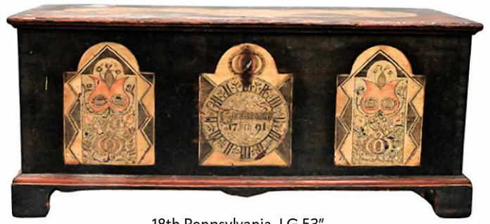
18th Pennsylvania, LG 53"