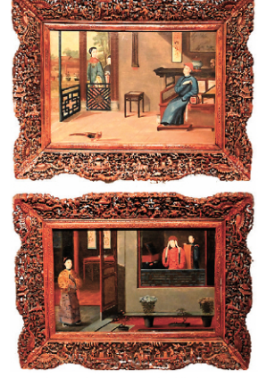
18th/19th c., o/c 15"x22"