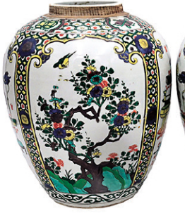
Chinese Porcelain, Height 12"