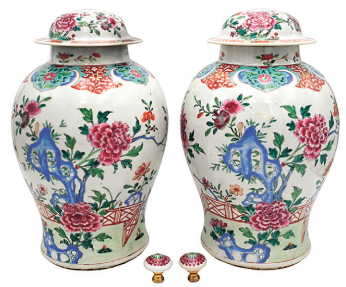
Chinese, Height 15"