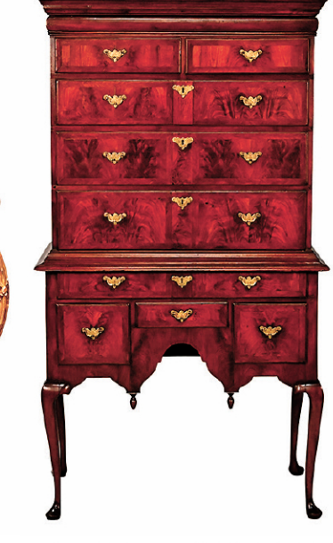
Walnut, Boston, HT 70", WD 34"