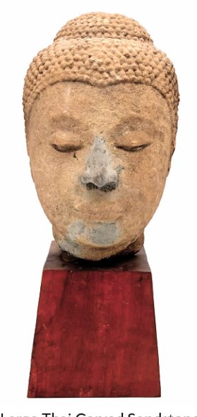
Large Thai Carved Sandstone HT 14"