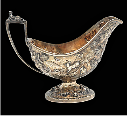
S. Kirk and Son Sterling, HT 6", LG 8"