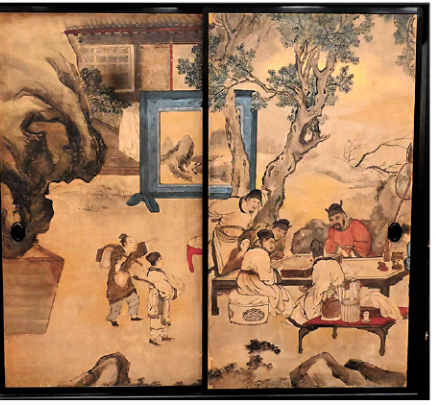
Large 1 of 2, Painted Panels