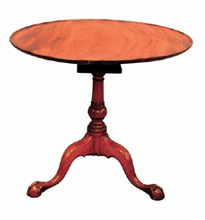
Chippendale Mahogany Tea Table, DIA 33"