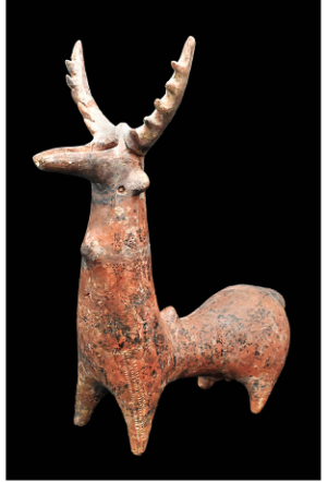
Iranian 1st millennium B.C.