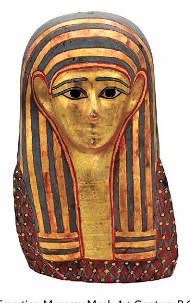
Egyptian Mummy Mask, 1st Century B.C. HT 19"