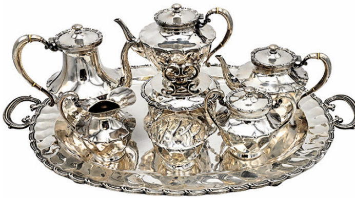
Eight Piece Sterling Silver Tea and Coffee Set