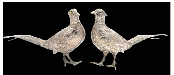
Large silver Germany, LG 18"