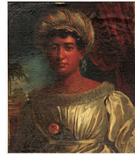
In the Manner of Charles Bird King