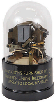
Western Electric Ticker Tape