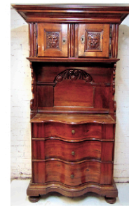
Selection 18th & 19th Century Furniture

TERMS: Cash, check, all major credit cards, wire transfer, ACH • Buyers Premium 28%, 3% cash or check discount • Wire fee $20, ACH accepted Sales Tax 8.125% unless New York State ST120 sales tax exemption is filed with us or items shipped out of state by certified shipper.