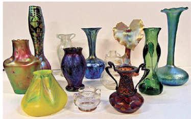
Loetz & Other