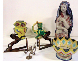
WW and other