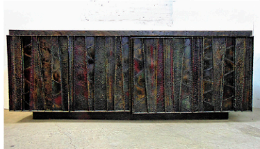
Paul Evans Brutalist sideboard, signed & dated 1968