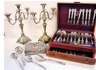
Large Selection Sterling Silver