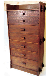
Charles Rohlf, 1900