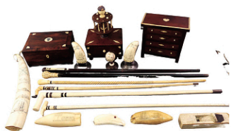
60 Whale bone items