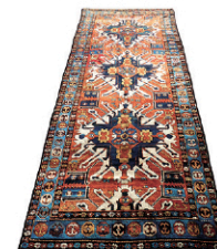
30 fine Oriental rugs