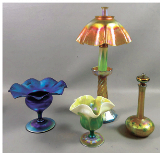
Tiffany art glass