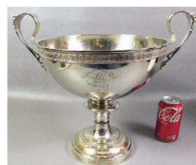
Tiffany 5 lb sterling trophy