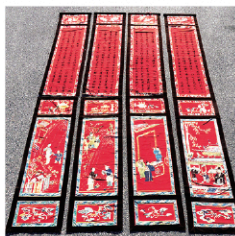
Four 11 ft Chinese panels