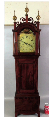
Joshua Wilder dwarf clock