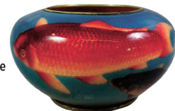
Fine Japanese cloisonne pieces