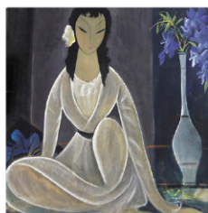
Lin Fengmian (1 of 2)