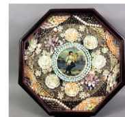
1 of 3 seashell valentines