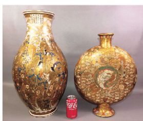
Super Japanese Satsuma pieces