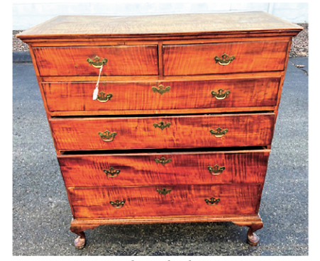
Curly Maple Chest