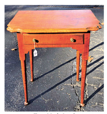
Tiger Maple Stand