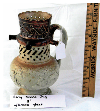
One of 3 Puzzle Jugs