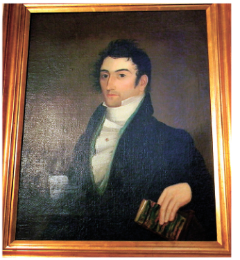
Early Portrait OOC

15% Buyers Premium - CASH, DEBIT, MASTERCARD/VISA, In-State Check Please bring boxes and packing material. Successful bidders will pack their own purchases.