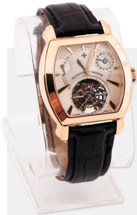
Vacheron Constantin Malte Tourbillon Watch Price Realized: $39,300