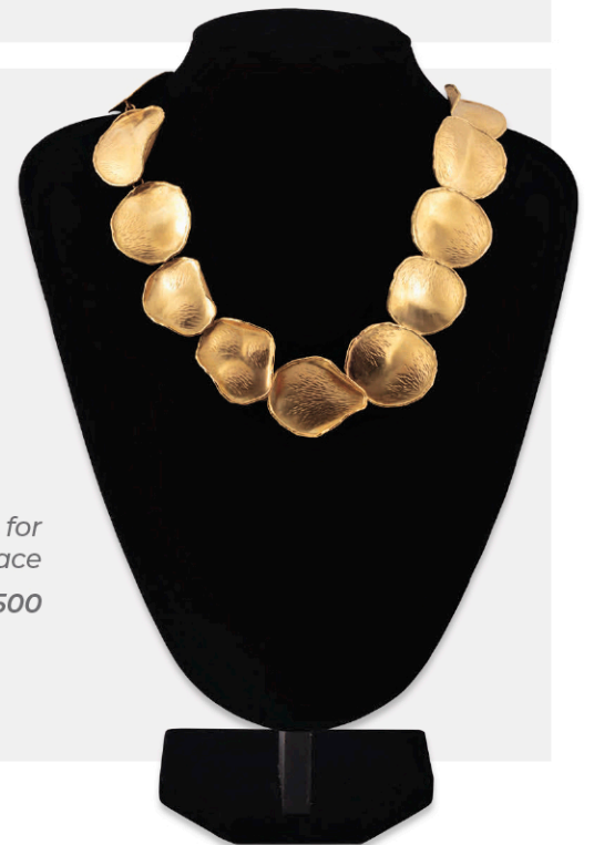
Angela Cummings for Tiffany & Co. Gold Necklace Price Realized: $11,500

All prices include a 21% buyers premium.