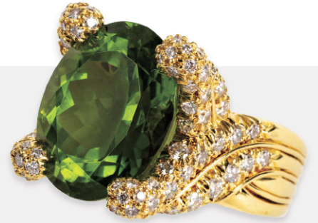
Henry Dunay Peridot & Diamond Ring Price Realized: $5,100