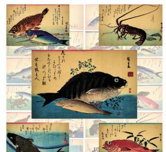
Utagawa Hiroshige (1797-1858) intact book with 20 woodblocks of fish