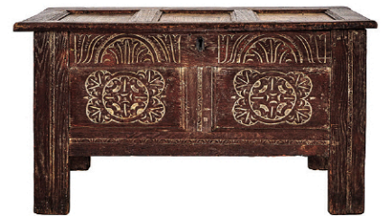
17th c English carved oak lift top chest