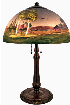
signed Handel table lamp