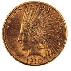
US 1910-D Indian $10 gold coin