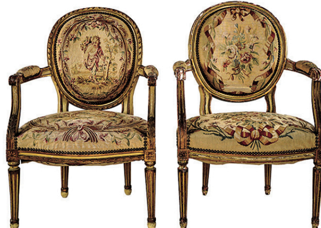
pair of Louis XVI gilt fauteuils