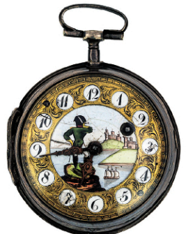
Fine coin silver & enamel pocket watch