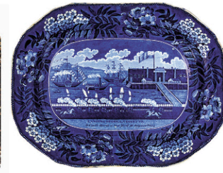
Landing of Lafayette Historical Staffordshire platter