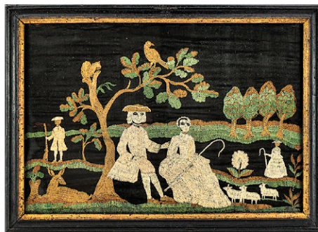
18th c needlework courting scene