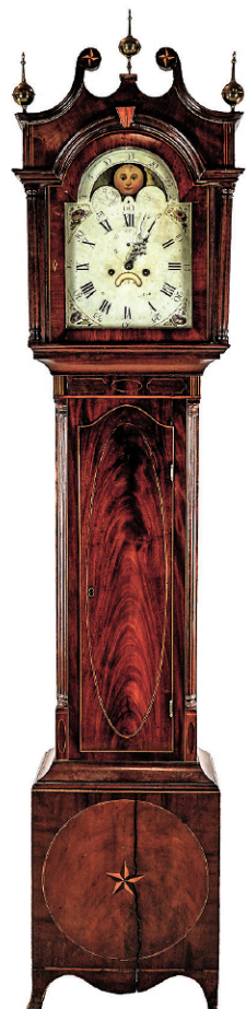
Federal inlaid tall case clock