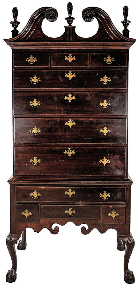
Chippendale walnut Philadelphia highboy