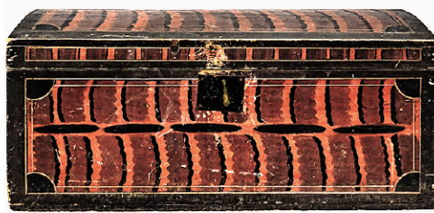
Vermont paint decorated dome top box