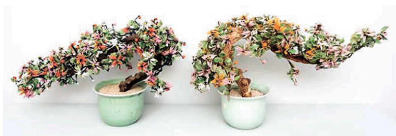
Antique Jade Trees

Please allow us to introduce ourselves, an auction of wealth and taste. Old Kinderhook Auction Company has gone down into the depths and come back like a bat out of Hell with 666 lots of temptation. Art, Asian antiques, silver, and ceramics make a most sinful celebration, together with furniture you'd be happy to sit with for all eternity. Consigned to the inferno, offered with no reserve. This auction is hot, and it's getting even hotter. Better start fanning that paddle.