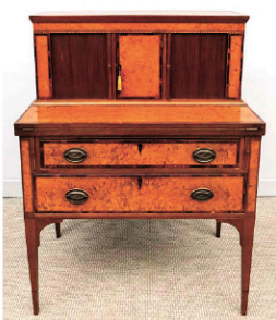
Large Selection of Period Furniture