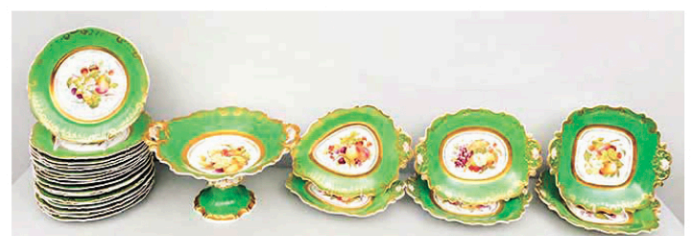
Extensive Botanical Service