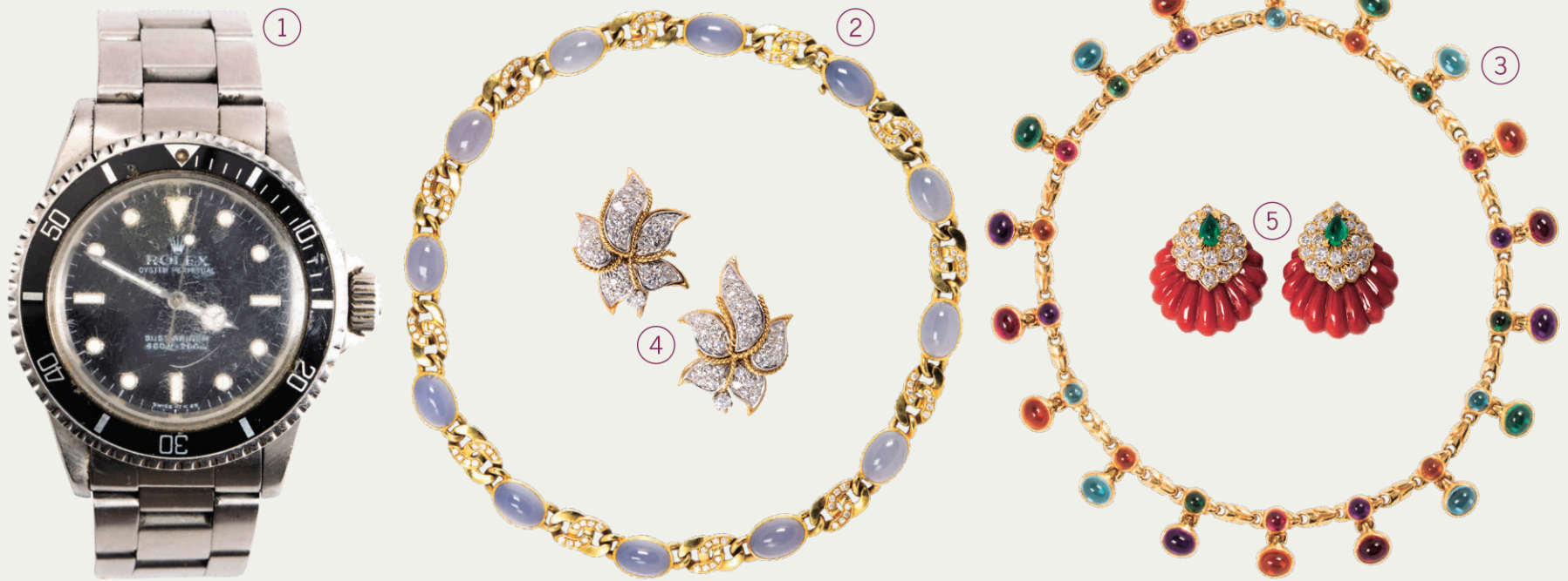
1. Rolex, a stainless steel 'Submariner' wristwatch. 2. Bulgari, a blue chalcedony, diamond and 18k gold necklace. 3. Bulgari, a gemstone and 18k gold 'Passo Doppio' necklace, circa 1990s. 4. Tiffany & Co. Schlumberger, a pair of diamond, 18k gold and platinum earrings. 5. David Webb, a pair of coral, diamond, emerald and 18k gold ear clips.