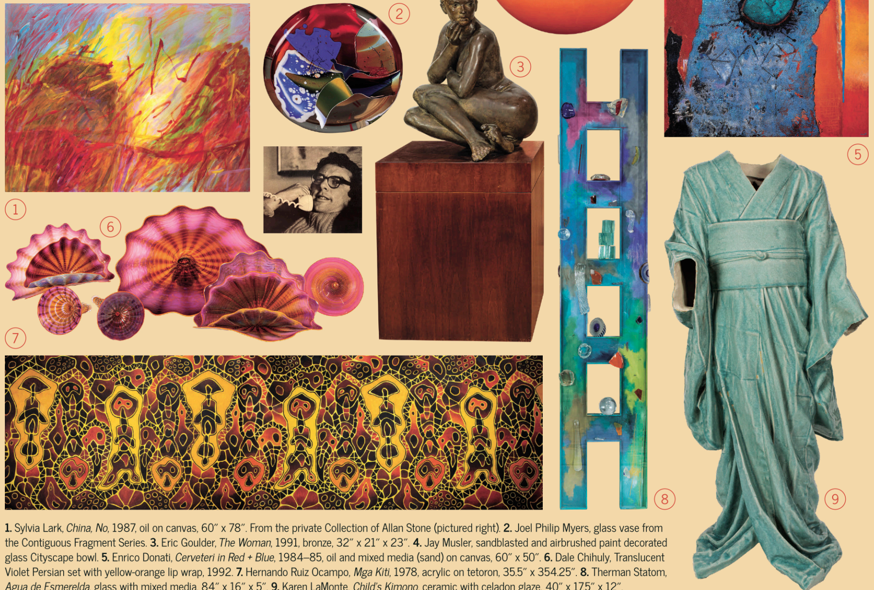
1. Sylvia Lark, China, No. , 1987, oil on canvas, 60" x 78". From the private Collection of Allan Stone (pictured right). 2. Joel Philip Myers, glass vase from the Contiguous Fragment Series . 3. Eric Goulder, The Woman , 1991, bronze, 32" x 21" x 23". 4. Jay Musler, sandblasted and airbrushed paint decorated glass Cityscape bowl. 5. Enrico Donati, Cerveteri in Red + Blue , 1984-85, oil and mixed media (sand) on canvas, 60" x 50". 6. Dale Chihuly, Translucent Violet Persian set with yellow-orange lip wrap , 1992. 7. Hernando Ruiz Ocampo, Mga Kiti , 1978, acrylic on tetoron, 35.5" x 354.25". 8. Therman Statom, Agua de Esmeralda , glass with mixed media, 84" x 16" x 5". 9. Karen LaMonte, Child's Kimono , ceramic with celadon glaze, 40" x 175" x 12".