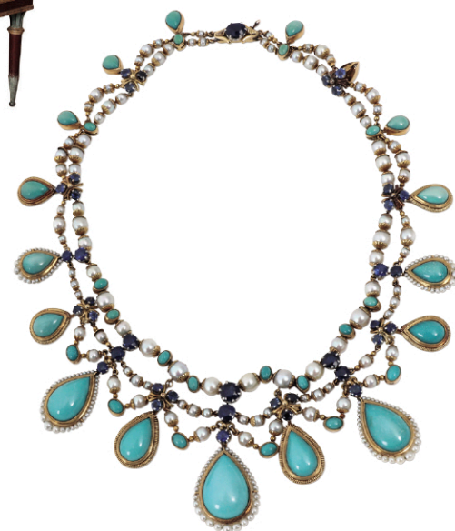
A French sapphire, turquoise, cultured pearl and 18kt gold necklace

Andrew Jones Auctions | 2221 S. Main St. | Los Angeles, CA. 90007