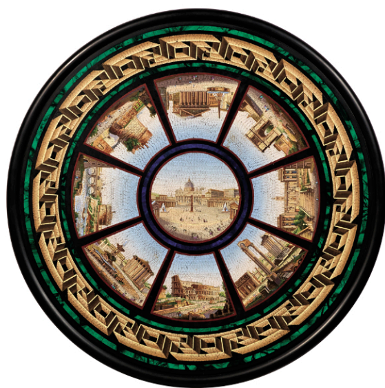
A fine Italian micromosaic table top, probably the workshop of Cesare Roccheggiani, Rome, fourth quarter, 19th century