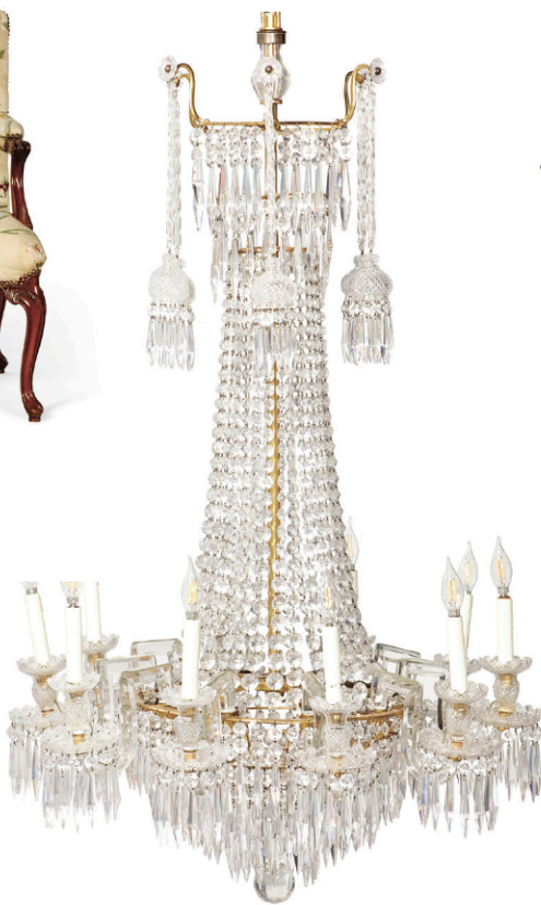
A Belle Epoque style gilt bronze and clear glass ten light chandelier, Maison Bagues, second half 20th century