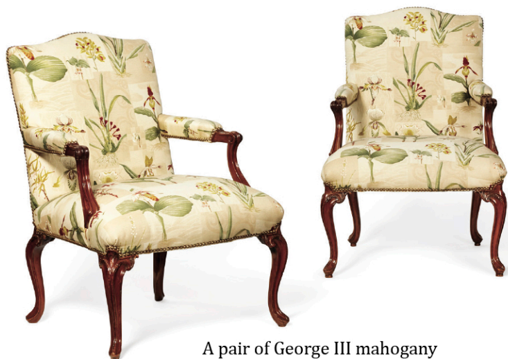
A pair of George III mahogany open armchairs, circa 1770