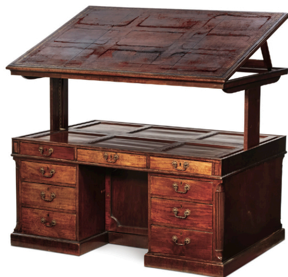
A Regency mahogany mechanical architect's partners' desk, Probably Gillows, circa 1810