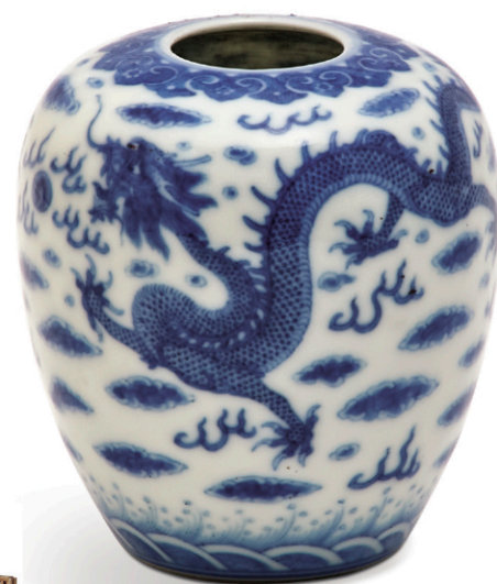
A Chinese blue and white glazed porcelain dragon vase