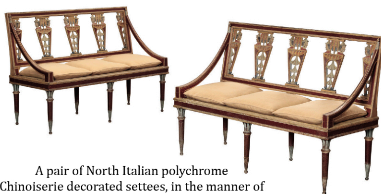
A pair of North Italian polychrome Chinoiserie decorated settees, in the manner of Giuseppe Levati, Lombardy, late 18th century