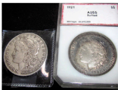
US Silver $'s