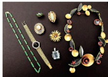
PART COLLECTION ESTATE JEWELRY