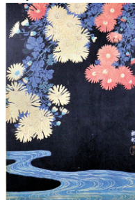
OHARA KOSON (Japanese, 1877-1945). Chrysanthemums and Running Water ("Kikura ni Ryusui"), circa 1931