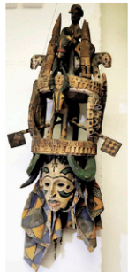
Nigerian Yoruba Helmet Mask

SLOANS & KENYON Auctioneers and Appraisers