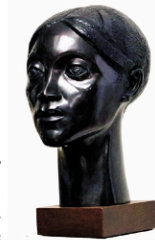
ELIZABETH CATLETT (American-Mexican, 1915-2012). GLORY, 1981, signed with initials and dated '81. Bronze