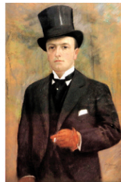
FRENCH SCHOOL (early 20th century). Young Gentleman Wearing a Top Hat, Smoking, 1912