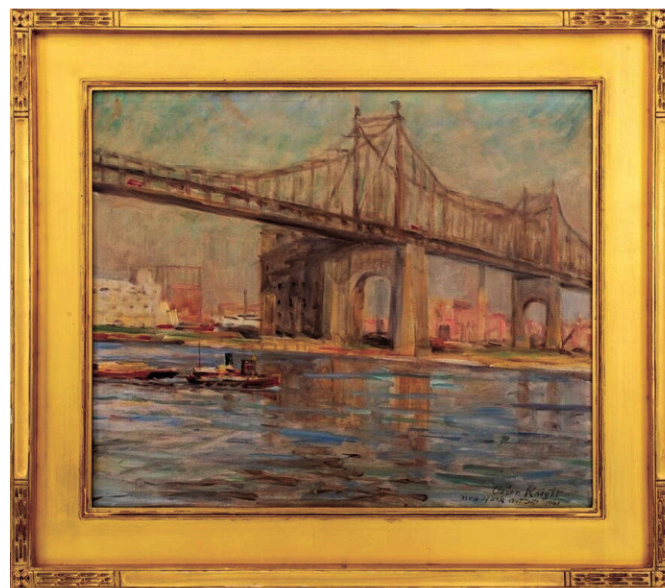
Louis Aston Knight "Queensboro Bridge" Oil, 1941