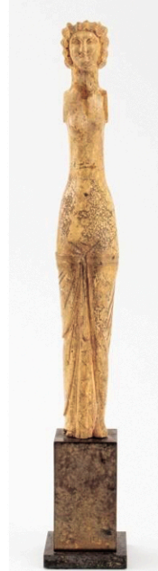
Ancient Roman Bone Venus Sculpture