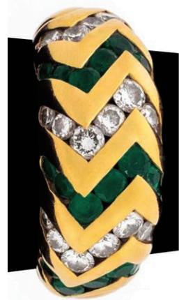
Bulgari 18K Gold Diamond Emerald Ring