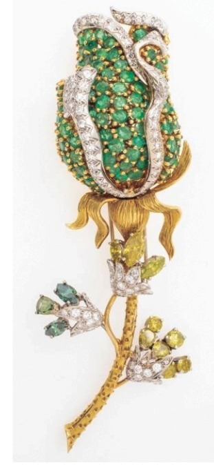
Handcrafted 18K Emerald Diamond Floral Brooch