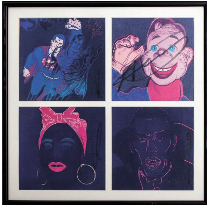
Andy Warhol Myth Series Screen Print Cards