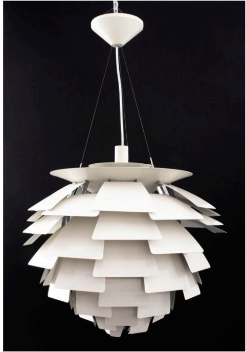
Poul Henningsen Artichoke Ceiling Light, 1958