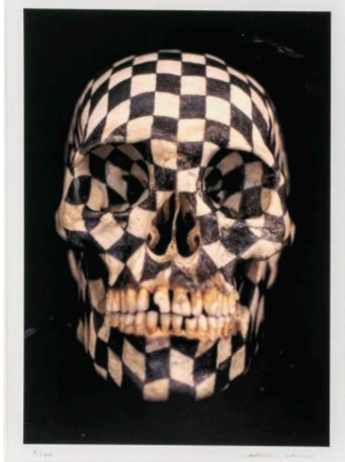
Gabriel Orozco "Black Kites" Digital Print, 2004