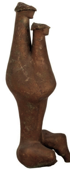
Mid-Century Modern Bronzed Plaster Sculpture