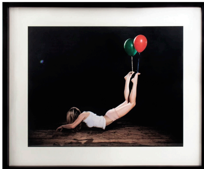
Sam Taylor-Johnson "Escape Artist" Digital C-Print