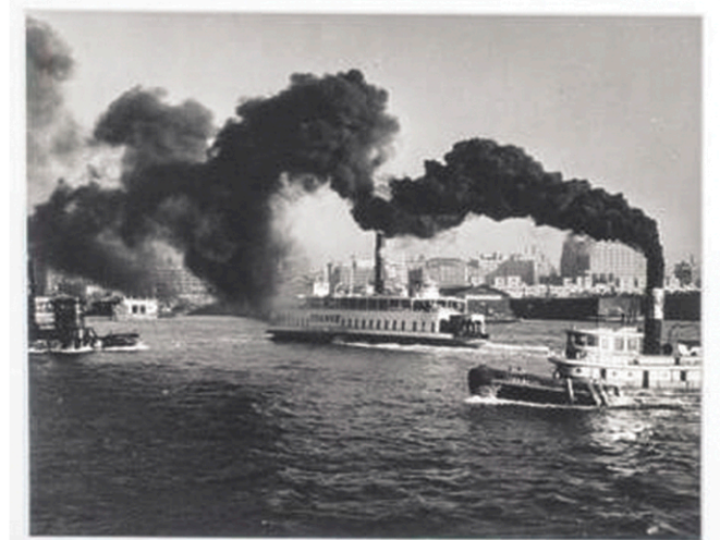
Andreas Feininger "NY Hudson River Ferries" Photo