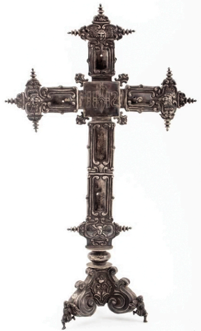
Spanish Colonial Silver Altar Cross, 18th C.