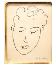
HENRI MATISSE (French, 1869-1954) Frontispiece, for: Jules Romains, Pierres Levees, 1948, Lithograph

Absentee, Telephone and Internet Bids Accepted