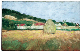
THEODORE ROBINSON (American, 1852-1896) Haystacks Oil on canvas