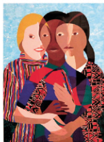
ELIZABETH CATLETT (American, 1915 - 2012) Three Women of America, 1990 Limited edition color screenprint