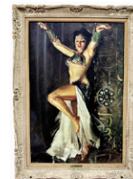
NINO MARI (Italian, 20th century) Showgirl Oil on canvas