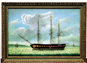
AMERICAN SCHOOL (Early 20th century) Sailing Vessel Oil on canvas