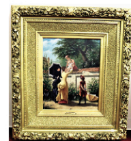
ANDRE DE PONTES (Continental, 19th century) Handing Over The Baby Oil on board