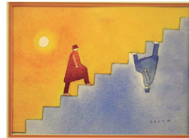
JEAN MICHEL FOLON (Belgian, 1934 - 2005) Up and Down