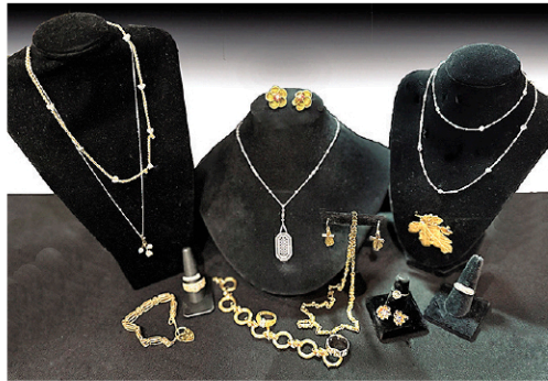
Fine Selection of Estate Jewelry

Preview: June 13, 1-6PM; June 14, 1-5PM; June 15, 10AM all day • Watch for upcoming Gallery Tour Videos • www.BurchardGalleries.com