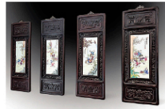
Chinese Framed Porcelain Plaques