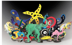
1025) Rolf Knie Sculpture