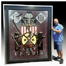
1220) Gary Erbe Vertebræ, 1972 Oil on Canvas