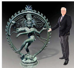
1015) Unbelievable Shiva Bronze