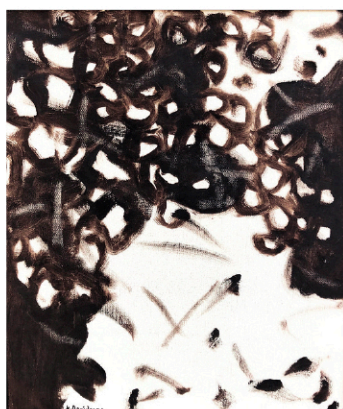
Kristian Davidsson (Denmark, Born 1917) Oil on canvas abstract painting. Sight size: 25 x 21 inches.