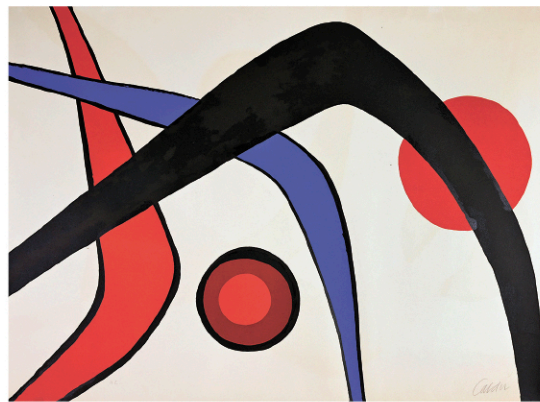
Alexander Calder (1898 - 1976) "Trois Arches" Pencil signed lithograph. Pencil signed and inscribed H/C in lower portion. Sheet size: 29 5/8 x 43.25 inches.