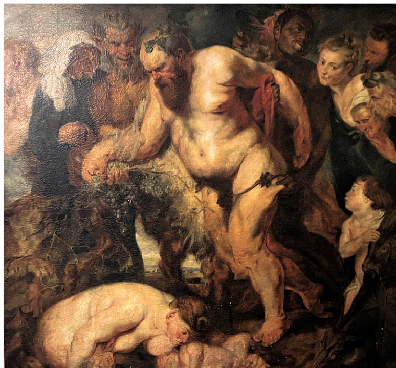
Monumental Follower of Sir Peter Paul Rubens (1577 - 1640) "The Drunken Silenus" Oil on canvas painting. Sight size: 82 x 82 inches. Provenance: From the collection of the Polasek Museum & Sculpture Gardens (Winter Park, Florida).