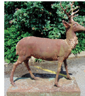
One of two cast iron deer