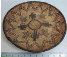
Sample Native American Baskets

3 PM: An extraordinary collection of early 20th Century magazines from the Estate of Paul Trent. Professor Trent began collecting when he was 14 and continued into his 80s. Approximately 150 lots, many almost or complete runs of Hollywood material.