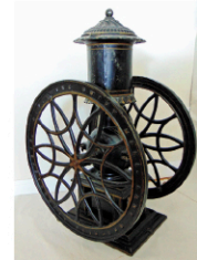
The Swift Mill Lane Brother Cast Iron Coffee Grinder