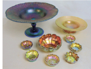
Selection Tiffany Artglass