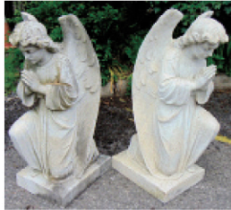
Pair lifesize carved marble angels