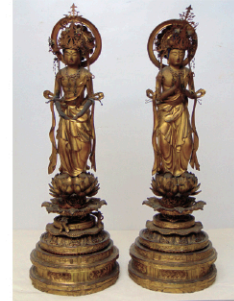
Pair of Japanese gilt wood temple attendants