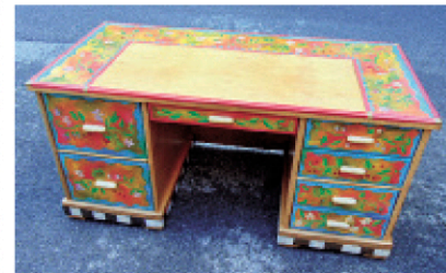
Paint decorated desk by Sticks, one of 9 pieces by Sticks.

TERMS: Cash, check, all major credit cards, wire transfer • Buyer's Premium 28%, 3% cash or check discount. Wire Fee $20. ACH accepted. • Sales Tax 8.125% unless New York State ST 120 sales tax exemption is filed with us or items shipped out of state by certified shipper