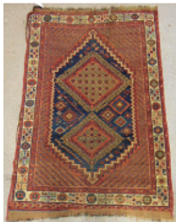
Selection of estate carpets