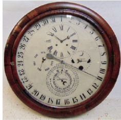
Gales Patent clock