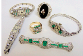
Large selection estate jewelry

Featuring an excellent sale with bidding through LiveAuctioneers.com and absentee and phone bidding in 3 sessions.