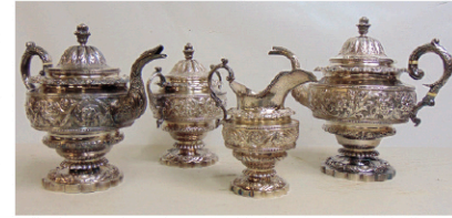
Marquand & Co sterling

PREVIEWS: SUNDAY, JUNE 16, 1 TO 5 PM, AND MONDAY, NOON TO 2:30 PM OR BY APPOINTMENT AFTER JUNE 7