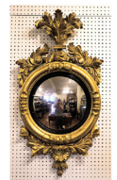
Beautiful Period Convex Mirror

ALL TO BE SOLD WITH NO RESERVE • We are open for in-person bidding! Online bidding through LiveAuctioneers.com, Invaluable.com, and AuctionZip.com