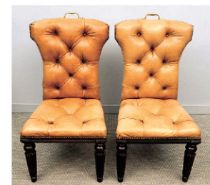
Ralph Lauren Furniture