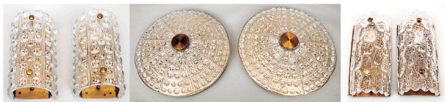
Carl Fagerland Collection