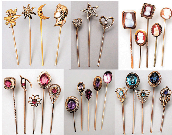
Single Owner Collection of Stickpins