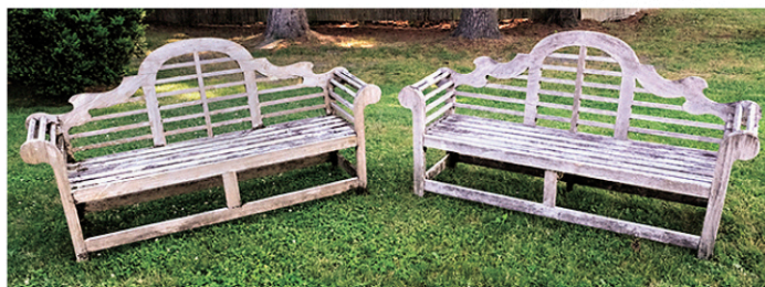
Designer Outdoor Furniture