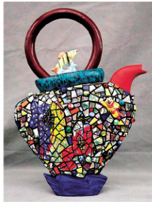
Hap Sakwa And Micheal Lambert (American, contemporary). Mixed media ornamental teapot, glass and ceramic mosaic