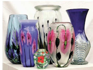
Part Collection Contemporary Art Glass by Charles Lotton and Other Makers