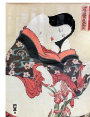
Woman with Iris, 1980