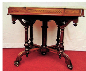
Victorian Carved and Inlaid Marble-Top Rosewood Center Table