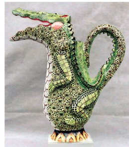
Ardmore Design, South Africa, "Crocodile Pitcher". Hand painted ceramic, signed by S Busise, painted by Nondumise, and dated 2019 - H: 11 1/4 in.; W: 10 in.