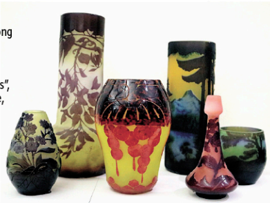
Part Collection Galle and Other French Art Glass