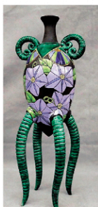
Kelly Torche Hong (American, 20th century). "Teapot with Morning Glories", Amphora shape, four-legged polychromed pottery vase. Signed. H: 17"