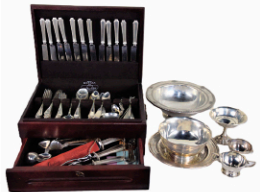
A Dozen Sterling Silver Lots