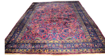
Sarouk Oriental Rug