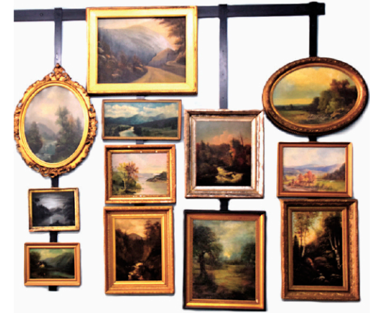
Signed and Unsigned White Mountain Paintings

Previews: August 1 (10am-4pm) & by appointment