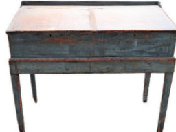
Early Clerk's Desk in Old Blue Paint