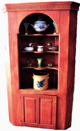
1 of 2 Corner Cupboards