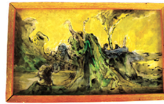
Kurt Seligmann Surrealist Artwork