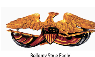
Bellemy Style Eagle