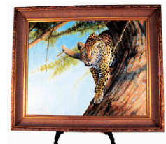
Grant Hacking Original Oil