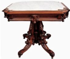
Marble Top Renaissance