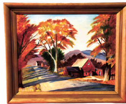
Emily Carr Original Oil