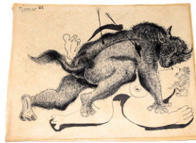
Picasso Original Drawing