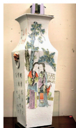
CHINESE FAMILLE ROSE SQUARE-SIDED VASE MOUNTED AS TABLELAMP.