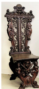
RENAISSANCE REVIVAL CARVED HALL CHAIR (ONE OF TWO)