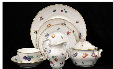
RICHARD GINORI "PERUGIA" PORCELAIN TABLE SERVICE