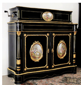
SWISS IDEAL INTERCHANGEABLE CYLINDER MUSIC BOX BY MERMOD FRERES Accompanied by eight cylinders (each with eight songs) and hand-written tune cards