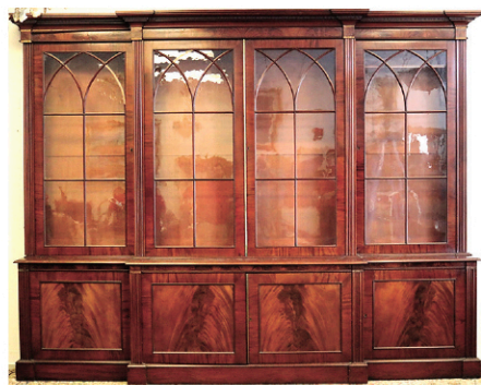
LATE GEORGE III MAHOGANY BOOKCASE CABINET