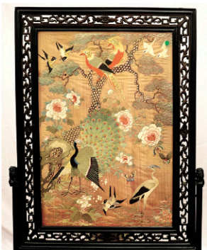
CHINESE FLOOR SCREEN WITH EMBROIDERED PANEL DEPICTING EXOTIC BIRDS IN LUSH FOLIAGE