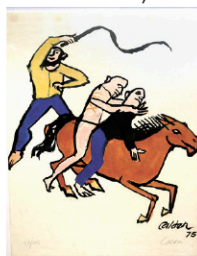
ALEXANDER CALDER (American, 1898-1976). Flight from Tyranny: for Amnesty International, circa 1975