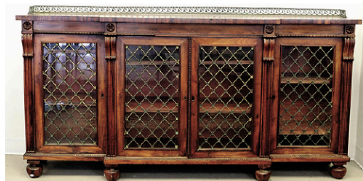
LATE GEORGIAN MAHOGANY FOUR-DOOR GRILLED-DOOR CABINET. 19th century