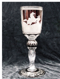
BOHEMIAN WHEEL-CUT RUBY-TO-COLORLESS CRYSTAL GOBLET. circa 1820

Absentee, Telephone and Internet Bids Accepted