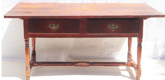
Early Work Table with Removable Pinned Top