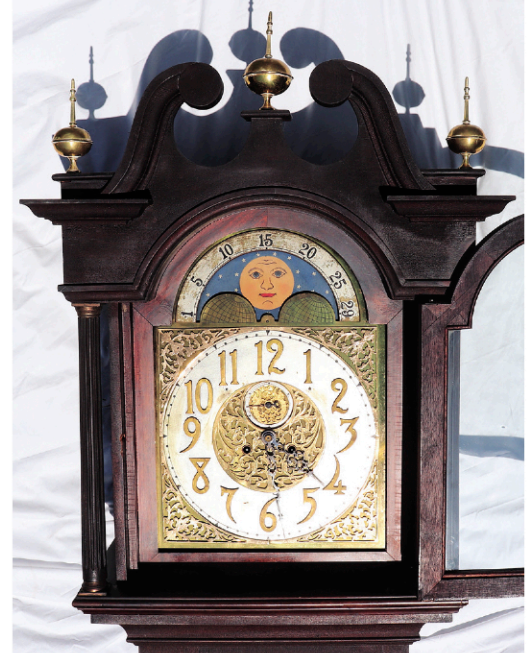
Waterbury Mahogany Hall Clock #58