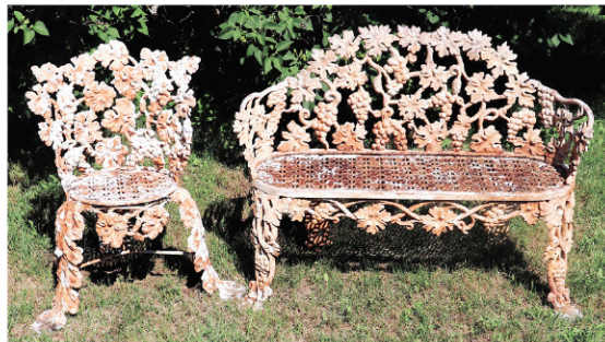
Kramer Bros. Heavy Grape & Vine Cast Iron Furniture