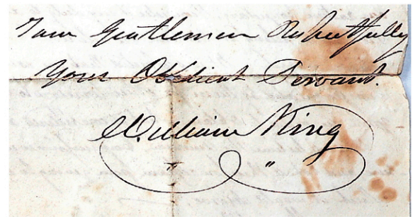
Important 1820 Governor William King Signed Letter (One of a dozen historical signatures)