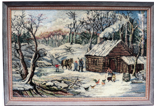
Winifred Wallingford Hooked Rug of Currier & Ives Scene