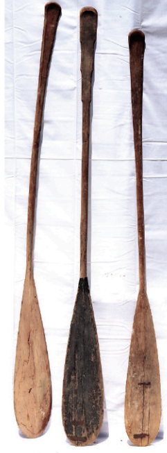
Three 19th Century Penobscot Indian Canoe Paddles