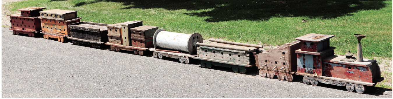
Folk Art Scaled Down Birdhouse Train Set, Approx. 25' long

Preview by appointment in the week prior to sale, open to the public on Monday, August 19th from 8am to 5pm and morning of sale 7:30 am to 9:45 am. Sale will be held at the Talbot Farm, Poplar Hill, Turner, Maine.