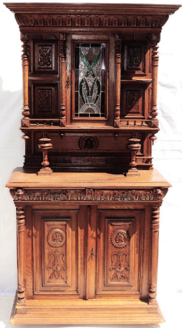
Fancy Victorian, Heavily Carved Oak Buffet Cabinet with Stained Glass Center Door