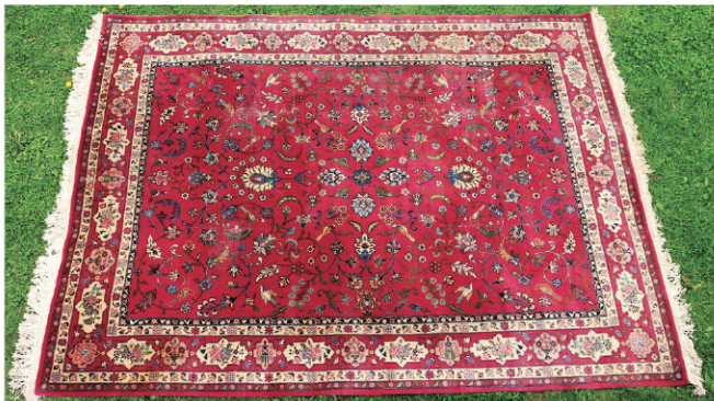
One of Many Oriental Rugs