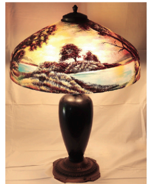
Pittsburg Reverse Painted Lamp with Chipped Ice Shade