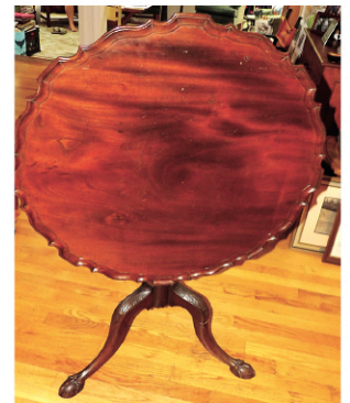
Period Chippendale Pie Crust Table