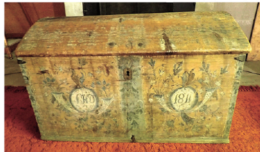
19th Century Painted Immigrant's Chest