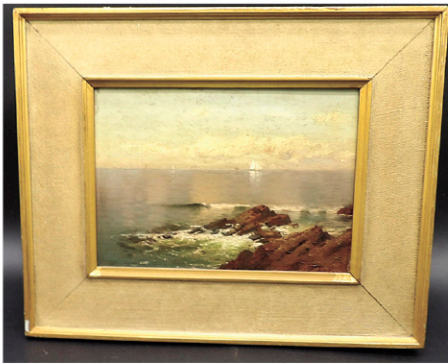
AT Bricher (1837-1908) Oil On Boards