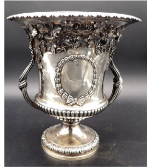
Paul Storr (1771-1844) Neoclassical Wine Cooler 72 oz