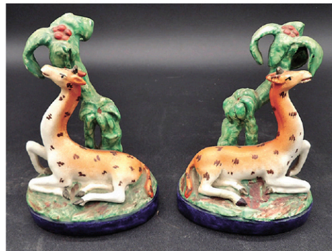
From a Selection of Staffordshire Figurines & Cottages