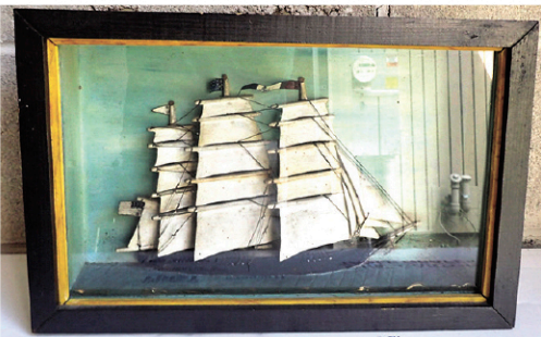
Civil War Era Carved Wooden Ship's Diorama In Shadow Box