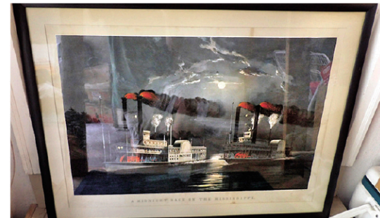
Currier & Ives Racing on the Mississippi