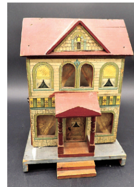
Bliss Dollhouse & 100's Pieces of Vintage Doll Furniture