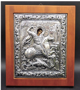
950 Sterling Greek Icon St George Slaying The Dragon By Albrecht Dre