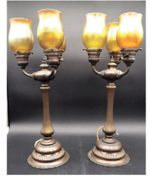
Pair of Greco Roman 3 Light Tiffany Torchier Favrile Pulled Feather Shades