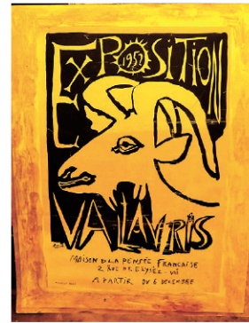
Rare Picasso Art Poster 1952