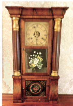
Seth Thomas Triple Decker & Other Clocks