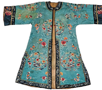
Qing Dynasty Chinese Silk Robe