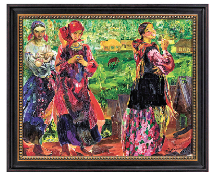
Philippe Andreevich Maliavin (RU 1869-1940) o/c "Three Babas"