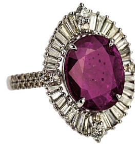
5.24 CT Natural Ruby & Diamond Ring