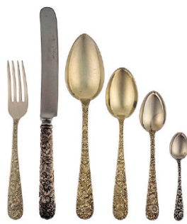
95 pcs. Kirk Repousse Sterling Silver Flatware