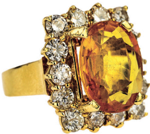
10 CT Yellow Sapphire & Diamond Ring