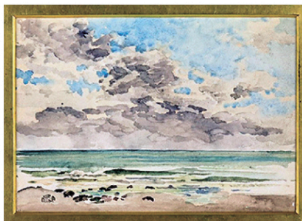
James McNeil Whistler (AM 1834-1903) w/c "The Sea Grey & Silver"