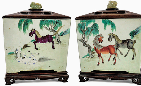
Exceptional Pair of 18th c Chinese Cache Pots