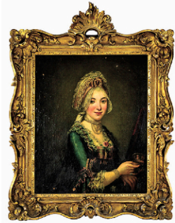
Francois Hubert Drouais (FR 1727-1775) Portrait of a girl