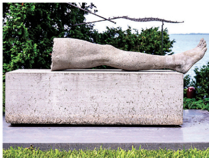
Erwin Wurm (AM 1954-) A Fountain for Arthur Rimbaud