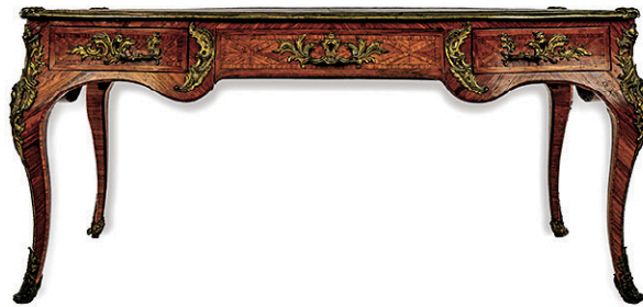
Fine Louis XV 18th c Bureau Plat Writing Desk