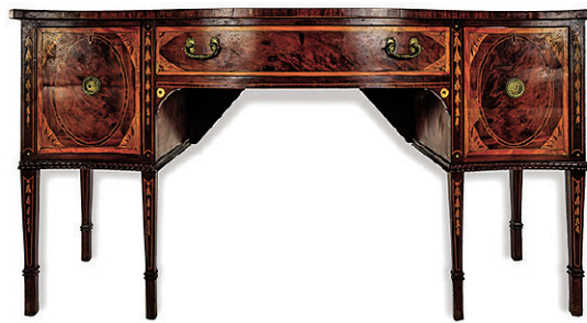
Fine Inlaid Georgian Hepplewhite sideboard