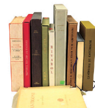
1 of 20 book lots

NadeausAuction.com Bid live at Liveauctioneers