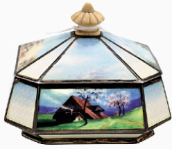
Silver & Enameled, ht 2 1/2"