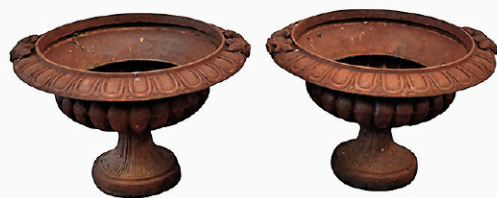
Outdoor iron, 1 of 20 lots