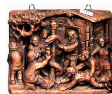
Black Forest carving