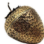
Tiffany & Co, 1 of 4 lots