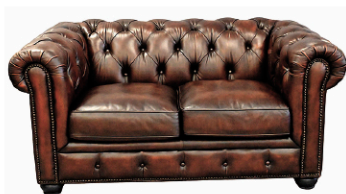
Chesterfield, lg 64"