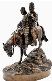
Albert Moritz Wolff, bronze, ht 11 1/2"