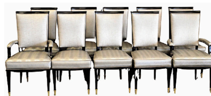
Artistic Frame, retail 13k