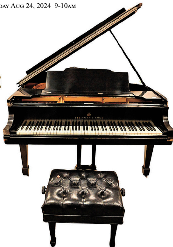
Steinway Baby Grand