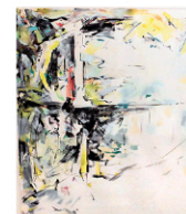
George Negroponte, Gouache, 22 1/2x18"