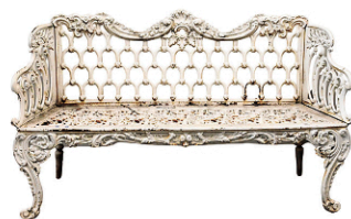
Outdoor cast iron, 1 of 2 benches