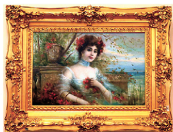
1 of 12 Portrait paintings