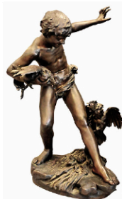
Paul Romaine Chevre, bronze, ht 29 1/2"