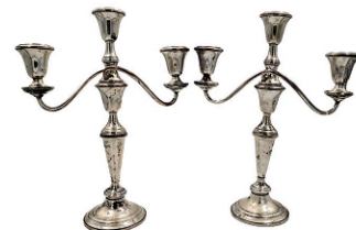
Cartier, 1 of 30 silver lots