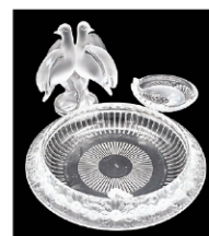
Lalique, 1 of 3 lots