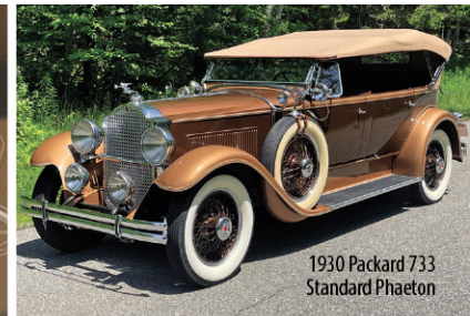
1930 Packard 733 Standard Phaeton