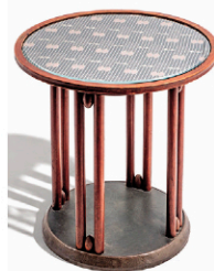
Josef Hoffmann for Thonet Table, Fledermaus, Vienna Secession Classic With Label