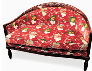
Paul Follot SS Normandie Style Carved Art Deco Settee

The period from 1850 to 1950 was characterized by significant change and disruption, encompassing major historical events and artistic movements. This era saw the rise of the Industrial Revolution, Romanticism, and Realism, followed by movements such as Orientalism, Impressionism, and the Arts and Crafts movement. The century also witnessed major conflicts, including the United States Civil War, the Spanish-American War, and both World Wars. Key artistic and cultural shifts included the Gilded Age, the Russian Revolution, the Jazz Age, Art Nouveau, the Vienna Secession, Futurism, and Modernism, among others.