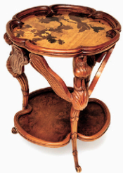
Signed Galle Dragonfly Inlaid French Marquetry Inlaid 2 Tier Table, 1900