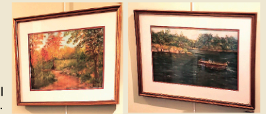
Ruth Uhlig Watercolors