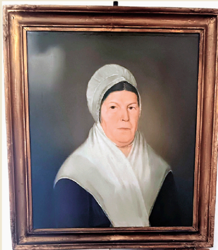
Charles Willson Peale-attributed Portrait of a Quaker Lady, circa early 1800s. Sotheby's catalog states, "An old label on back attributes the painting to Charles Willson Peale and indicates that it was exhibited at the Peale Museum in Philadelphia." This painting was purchased from Sotheby's Parke Bernet Estate Auction, November 18, 1960, lot #430, page 76 on Madison Ave, NY. Cleaned, restored, relined and inpainted. Frame has some gesso missing and some damage. 26 1/2" H x 23" W.