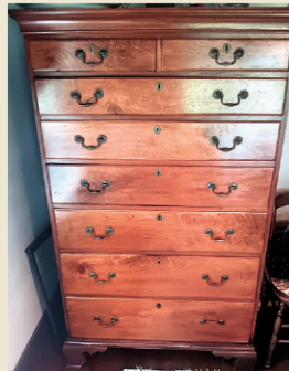
Important Walnut Chippendale Tall Chest of Drawers, Pennsylvania, has Cove Mandrill molded pediment above a case of two small drawers on top of six graduated drawers on a shaped ogival bracket. In excellent condition with some restoration. Circa 1760s to 1790s. Purchased at Sotheby's Parke Bernet Auction, November 18, 1960, lot #565, page 108, 3rd session. Seventh drawer down missing small piece of molding on top of the drawer. 42" W x 65" H