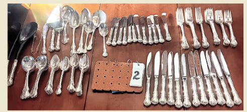
96-Piece French Provincial Sterling Silver Flatware Set by Towle