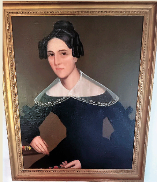
Ammi Phillips (attributed to NY & CT) Excellent oil on canvas painting of lady with rose and book, circa 1830s. Cleaned with some inpainting. Frame is 28 1/4" W x 35" H, Conserved, painted & restored (sight: 23 1/4" W x 30" H)