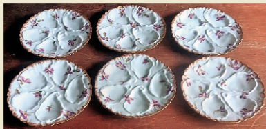
Six 19th-c. Limoges France Oyster Plates