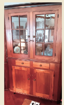
Pennsylvania Two-Part Corner Cupboard