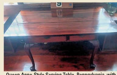
Queen Anne-Style Serving Table, Pennsylvania, with oblong top extending over a plain frieze with two thumb molded drawers on cabriole legs, ending on pad feet with a tilt-top mechanism. Expertly refinished. Circa 1760s to 1790s. Purchased at an English-American Society, Sotheby's Parke Bernet NY, Estate Auction at 980 Madison Ave., November 18, 1960, lot #554, page 105, 3rd session. 52 1/2" L x 43 1/2" W x 28" H

All items sold as-is with no guarantees or warranties.