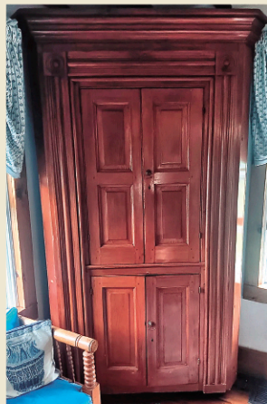
American pine one-piece corner cabinet with four wood doors, circa 1790s to 1810s. This has raised panel doors, is pinned and pegged, and has needed side panels and bun feet. Comes with two matching hand forged locks. No contents included. 49" W x 83 1/2" H