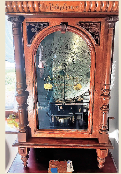
Circa 1899 Altona Ottensen Polyphon disc player with 21 extra discs