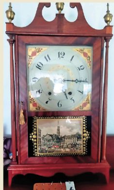
Excellent Pillar and Scroll shelf clock by Wadsworth Lounsbury & Turners, Litchfield, CT. In working condition, refinished and replaced hands, has floral face and two weights. Circa 1800-1830. 32" H x 17 1/2" W.