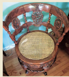
Oriental 19th-c. Exceptional Dolphin Footed Chair. Circa 1830s to 1860s