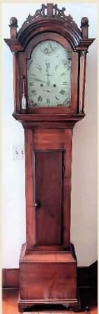
Grandfather Clock with Solid Cherry Face 1830s