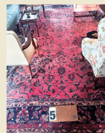
Exceptional Serapi? Oriental hand-woven rug with red and blue background colors. Circa 1890s. Some wear spots and repairs. 192" L x 117" W