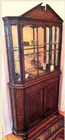
19th-c. Inlaid Curio Cabinet