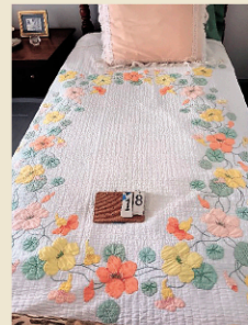
Matching Pair of Hand Done American Floral Applique Quilts. Circa 1830s to 1860s.