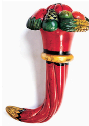
Large grouping of Odd Fellows and lodge memorabilia