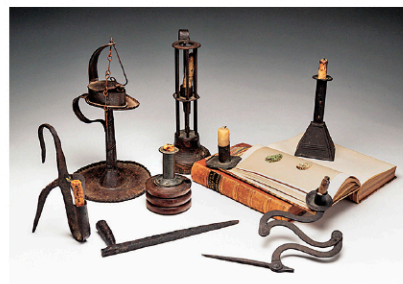
Extensive & unusual period lighting selection