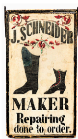
Large selection of 19th Century trade signs, incl. this German & English double-sided example