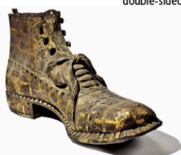
Large and unusual early shoe trade sign