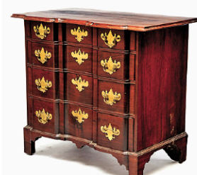
Diminutive Massachusetts Block Front Chest