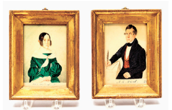
Early Watercolor Portraits

One of the best Americana auctions to sell at the Garth's Barn in many years, with roughly 1,000 lots of well-documented, important, and scarce examples of 18th & 19th Century folk art, furniture, and decorative accessories with provenances from notable dealers and collectors from the 1970s through today. Of note are the wonderful examples of period New England furniture, weathervanes, trade signs, Odd Fellows & lodge material, works on paper, redware, lighting, baskets, and treen - many fresh-to-market examples from collections that have been built over 50+ years!