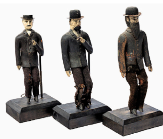
Folk art carved figures, incl. these 19th Century Ohio examples, ex David Good