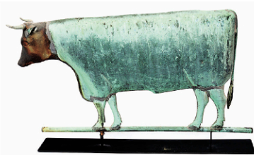
Large selection of period weathervanes, incl. this steer in wonderful surface