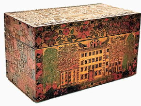
Early painted and chip-carved box, ex Israel Sack & Co