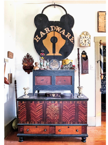
Large and impressive collection of painted furniture, folk art, and trade signs