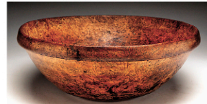
Fine burl bowls