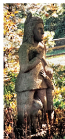
Folk Art incl. a selection of Popeye Reed carvings