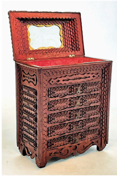
Wonderful tramp art ladies' desk & box