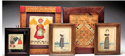
Large selection of wonderful 18th & 19th Century watercolors