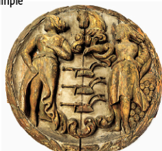
Large folk art carving of the first state seal of New Jersey, circa 1800, ex Stephen Score