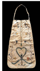
Textiles incl. a scarce embroidered bride's pocket