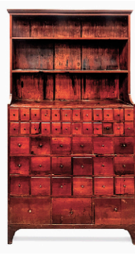
Unusual pewter apothecary, ex C.L. Prickett