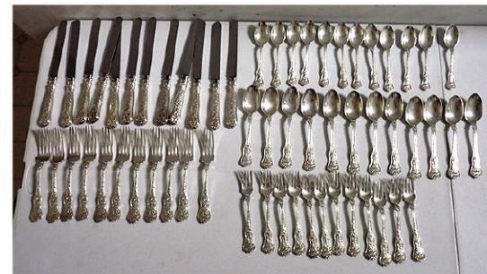
Tiffany Sterling Silver Olympian Flatware Set & Much More Sterling

See Our Website: https://centralmassauctions.com/ for More Information.