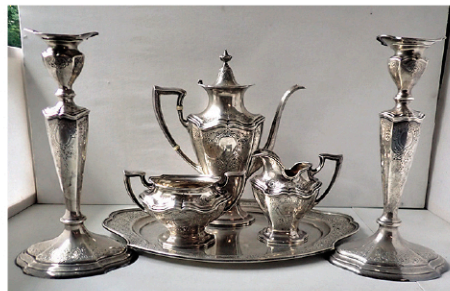
Reed and Barton Sterling Tea Service with Tray and Candleholders