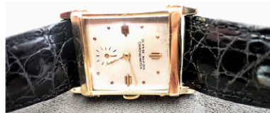
14K Ulysse Nardin Chronometer Men's Wristwatch & other Pocket Watches + Wristwatches