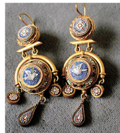
Antique Italian Micro Mosaic 18K Earrings