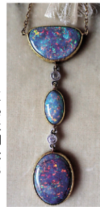
Antique 14K Gold Necklace with 3 Black Opals and 2 Mine Cut Diamonds