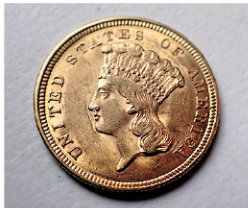
1854 "Indian Princess" Gold 3 Dollar Coin

Local Pickup Available on October 26th in Worcester area