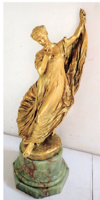
J. L. Gerome, Gold leaf on Bronze Statue of Woman - Green Alabaster base