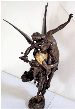
Bronze status with gold leaf F. Barbedienne, Fondeur Gloria Victis