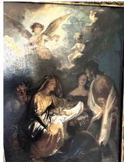
"The Nativity" Oil on Canvas Labeled Italian Baroque 17th Century