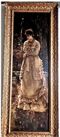
Alfred Stevens "Autumn" Canvas on Panel Christie's Provenance