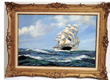
Montague Dawson Sailing Ship O/C Painting