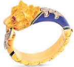
Panther Bracelet 18K Gold, Ruby, Diamond with Blue Enamel, French Maker and Purity Markings