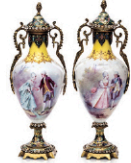
Sevres Porcelain, Bronze, and Champleve Enamel Lidded Urns