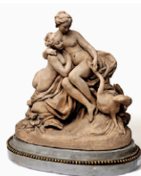
Francois Boucher (After) Sevres Signed Terracotta Sculpture of Leda and The Swan