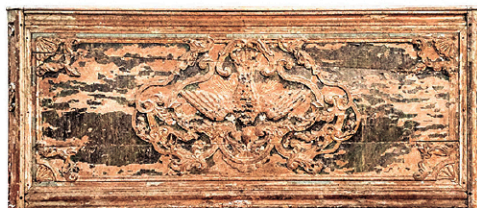
Chivalry Order Knights of the Holy Spirit, Altar Front Antependium, Monastery Meeting Hall of Royal