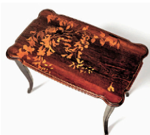
Signed Galle Marquetry Inlaid Table, Early 20th Century