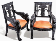
Pair of French Napoleon Style Throne Armchairs, Carved and Ebonized