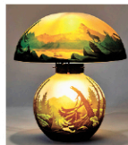
Muller Freres Signed Multi-Layer Cameo Glass Table Lamp, Circa 1925