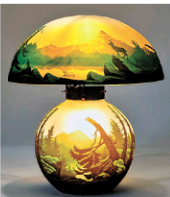
Muller Freres Signed Multi-Layer Cameo Glass Table Lamp

PLEASE SCAN ME TO BE DIRECTED TO THE AUCTION