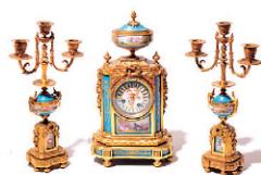
Sevres Gilt Bronze, Porcelain Clock and Candelabra Set, 19th Century