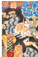
Charles Dufresne Signed Art Deco Gouache Painting on Paper