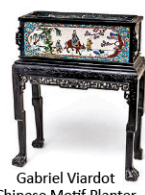
Gabriel Viardot Chinese Motif Planter on Stand with Longwy Porcelain Inserts