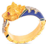
French 18K Gold, Ruby, Diamond and Blue Enamel Panther Bracelet