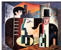
Jean Lambert Rucki Signed Cubist Oil on Canvas Painting, 1927

Online Only - Live Auctioneers and Invaluable Preview by Appointment Only • Wednesday–Sundays 11am–4pm • No preview Day of Sale