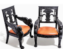
Pair of French Napoleon Style Throne Armchairs, Carved and Ebonized