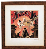
Georges Braque Pencil Signed Lithograph, 1956

Join us online at LiveAuctioneers and Invaluable for a unique selection of French art, antiques, and jewelry. Featuring over 30 exceptional clocks from the 18th to 20th centuries, 120 pieces of fine art, plus stunning furniture and lighting from designers like Galle, Viardot, and Philippe Starck. Our jewelry collection includes standout pieces such as a Cartier Enamel Ring and an 18K Gold Antique Carved Coral Brooch. Highlights also include rare Baccarat Crystal and Lalique Art Glass. Don't miss this opportunity to acquire timeless French treasures! Buyer's Premium: 30% Online (Live Auctioneers, Invaluable), 25% Absentee bids left directly with Collective Hudson