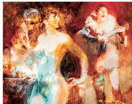
Lucien Ruolle Oil on Canvas Painting, Titled "The beautiful courted"