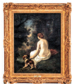
Narcisse Virgilio Diaz De La Pena, Important Oil on Canvas Painting, Circa 1893