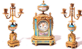
Sevres Gilt Bronze, Porcelain Clock and Candelabra Set

French art has profoundly shaped the global art landscape, continually pushing the boundaries of creativity and expression. From the elegance of Rococo and the intellectual rigor of Neoclassicism to the emotive power of Romanticism and the revolutionary techniques of Impressionism and Cubism, French artists have consistently redefined art's potential. Movements born in France didn't just capture the beauty of the world—they questioned it, transformed it, and inspired future generations to do the same, challenging artists and audiences alike to see the world in new, thought-provoking ways.