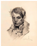
Salvador Dali, Lithograph, Portrait of Picasso Titled "Me Too, I Knew the Emperor", Hand Signed and Numbered