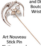
Art Nouveau Stick Pin Platinum and Diamonds

Van Cleef & Arpels Gold and Diamond Bouton d'Or Wristwatch