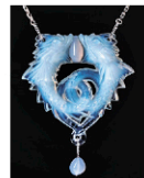
Lalique Opalescent Pendant in Original Box, Silver & Glass Necklace, 20th Century