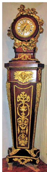
Lot 91A: Huge French clock with gilt bronze mounted cupids 90" high