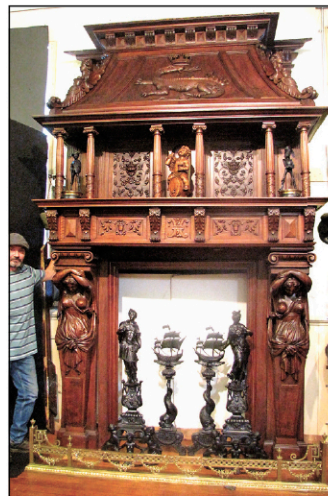
Lots 83-86: Exceptional hooded fire mantle & fire tools