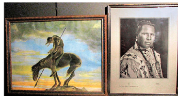
Lot 56: End of Trail & Lot #57: T. Hileman Print of Chief Heavy Breast