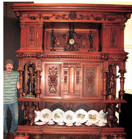
Lot 87: Huge walnut cabinet with men supports, cupids & much more. Bottom shelf: Sample of over 140 pieces of Shelley China being sold as box lots