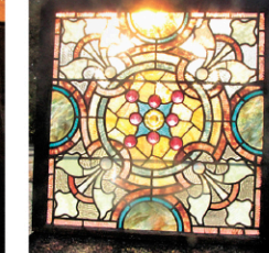
Lot 48: Victorian Drapery - rippled & jeweled stained-glass window & 4 other stained glass windows Please see lots 48-52