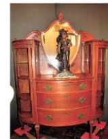
Lot 127: Victorian Olbrich & Goldbeck carved oak side by side china server