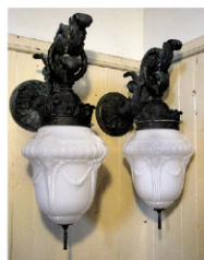
Lot 137: Pair of large antique exterior cast bronze acanthus leaf sconces