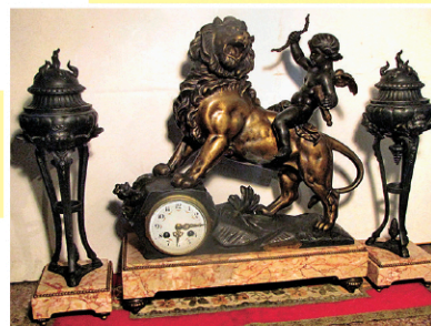
Lot 91: Cupid riding lion clock set w/ covered urn garnitures