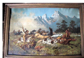
Lot 55: Cowboys & Indians wrangling horses