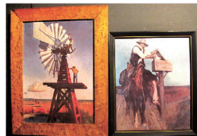
Lot 58: Windmill crew by Peter Hurd & Lot 59: Cream of Wheat ad, cowboy mailing letter