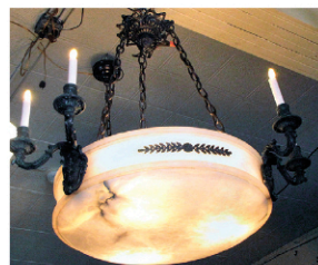
Lot 112: LG Empire style alabaster & bronze 6 arm chandelier 36" diameter