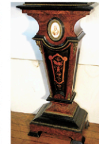
Lot 94: Pottier & Styms Bronze mounted inlaid Pedestal with Porcelain plaque