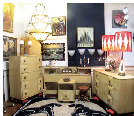
Mid Century Modern items (most lots 140 -160)