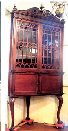
Lot 43: Huge corner China cabinet by Neuman & Co. NY.