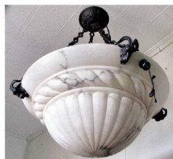
Lot 113: Large alabaster & bronze dome with rams heads & Hubbell pull chain switch 36" diameter