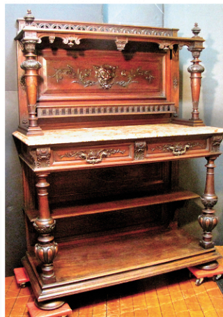
Lot 89: Walnut Marble top 2 tier server with Demon face by Bardie Ebeniste