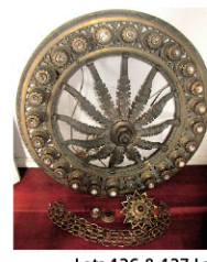
Lots 136 & 137 Large cast bronze pierced acanthus leaf ring light theater chandeliers 24 bulb & 12 bulb Each are 36" in diameter