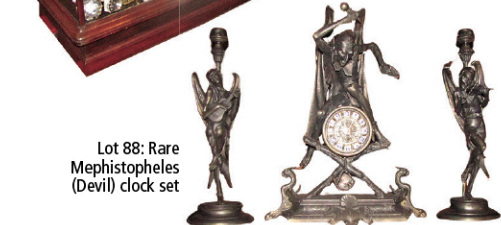
Lot 88: Rare Mephistopheles (Devil) clock set