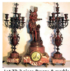
Lot 77: 3 piece Bronze & marble Clock set with Fairy, Cigale by Bouret sculpture