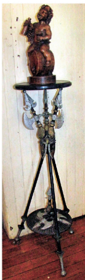
Lots 162 & 163: carved wood sculpture of Young Baby Bacchus & Tripod marble top Pedestal with Axes, Spears & 3 shields