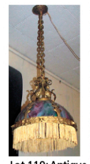
Lot 119: Antique Gothic Castle style bent panel stained glass chandelier