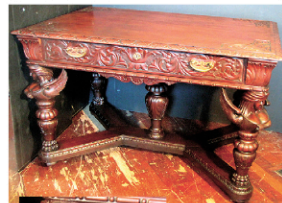
Lot 92: Mahogany large breasted winged lady bust table Lot 92 Detail: (left)