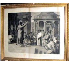
Lot 131: RARE engraving by T. Holloway, dated 1806 To the King Paul Preaching at Athens (after Raphael)