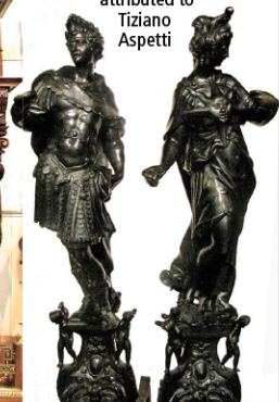
Lot 84 Detail: 16th century bronze andirons attributed to Tiziano Aspetti