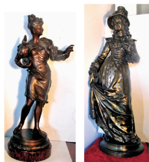
Lot 80: Bronze French lady with rooster. Signed A. Nelson