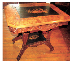
Lot 95: 2 tier Inlaid center table attributed to Daniel Pabst