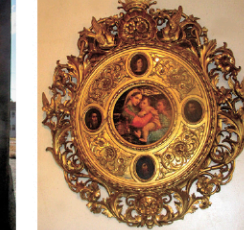
Lot 99: Museum quality O/C of Madonna & child with 16th century artist portraits in fine gold leaf frame 48" H x 45" W