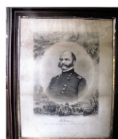
Lot 62: Engraving, General Ambrose F. Burnside