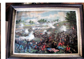
Lot 60: Battle of Bull Run - 1889 Kurz & Allison