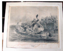
Lot 61: Rare PROOF engraving, Washingtons Adieu to his Generals