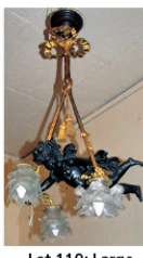
Lot 110: Large 2-tone bronze Cupid light fixture with rose shades