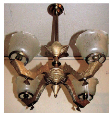
Lot 120: Victorian 4-arm gas chandelier with acid etched shades - electrified