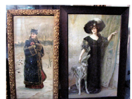
Lot 104: Rare Antique 1884 Julius Bien print - Central Park & Lot #108: Frederique Vallet Bisson print - The Departure