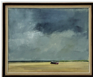
ANNE PACKARD, B. 1933 MASSACHUSETTS/NEW JERSEY O/B; 8 BY 10 IN.