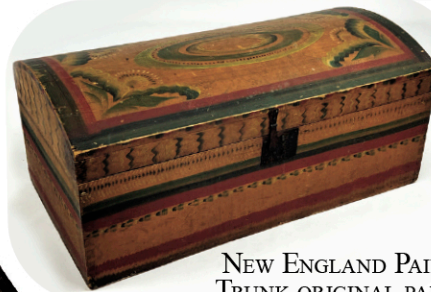
NEW ENGLAND PAINTED TRUNK ORIGINAL PAINT 14" H; 32" W