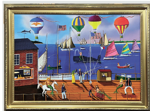
JEROME HOWES (AMERICAN, B. 1955) O/C; 28 BY 40 IN.