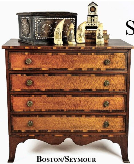
BOSTON/SEYMOUR ALSO SHOWN: PART OF A LARGE COLLECTION OF 19TH C. SCRIMSHAW

PREVIEWS AT THE CRN GALLERY: FRIDAY, OCTOBER 18 FROM 10 A.M. TO 5 P.M. SATURDAY, OCTOBER 19 FROM 10 A.M. TO 3 P.M. ALSO BY APPOINTMENT - LIMITED PREVIEW MORNING OF SALE