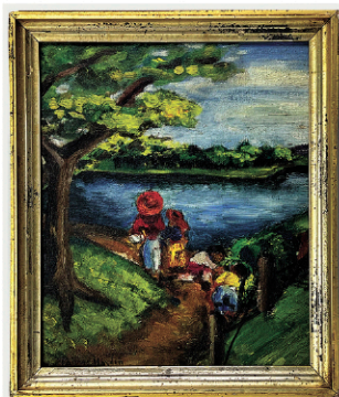
PALMER HAYDEN (AMERICAN, 1890-1973) O/B; 12 BY 10 IN.