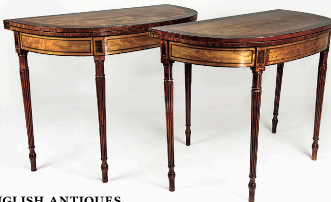
PAIR OF GEORGE III SATINWOOD AND MAHOGANY GAMING TABLES