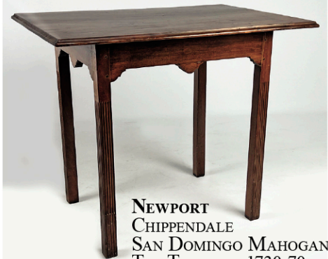
NEWPORT CHIPPENDALE SAN DOMINGO MAHOGANY TEA TABLE, c. 1730-70 ISRAELL SACK PROVENANCE