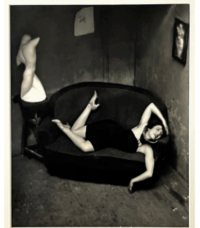
ANDRE KERTESZ (HUNGARY/AMERICA, 1894-1985) SATIRIC DANCER 1926 BELOW: BERENICE ABBOTT (AMERICAN, 1898-1991) QUEENSBORO BRIDGE, NEW YORK GELATIN SILVER PRINT PHOTOGRAPHS