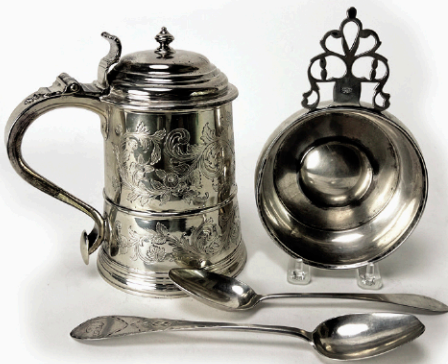
18TH C. BOSTON SILVER JACOB HURD TANKARD AND PORRINGER PAUL REVERE TABLE SPOONS