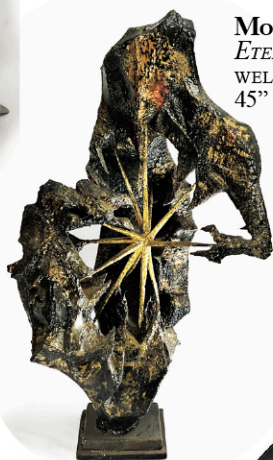
MORENON'S ETERNO CONFLICTO WELDED STEEL AND GILT 45" H