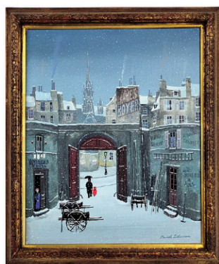
MICHEL DELACROIX (FRENCH, B. 1933) O/C; 13 BY 16 IN.