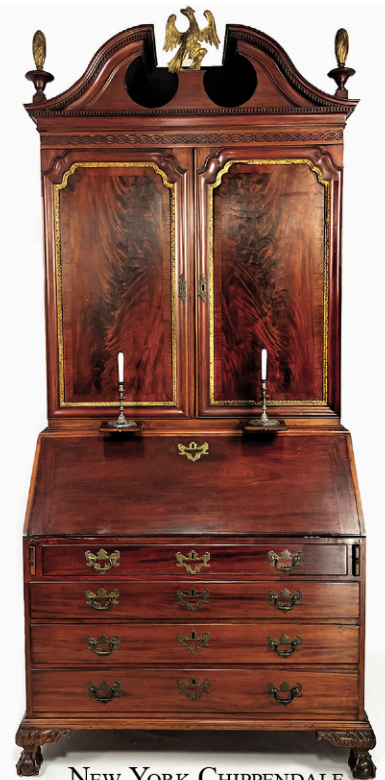
NEW YORK CHIPPENDALE MAHOGANY SECRETARY/DESK c. 1750-760 8'6" TALL; CASE 44" W DESCENDED THROUGH THE COOLIDGE FAMILY OF BOSTON