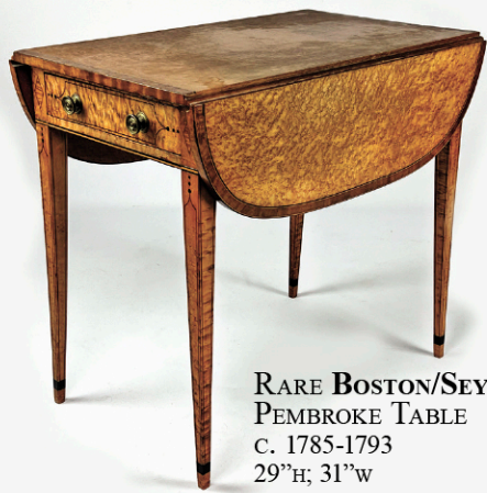
RARE BOSTON/SEYMOUR PEMBROKE TABLE c. 1785-1793 29" H; 31" W