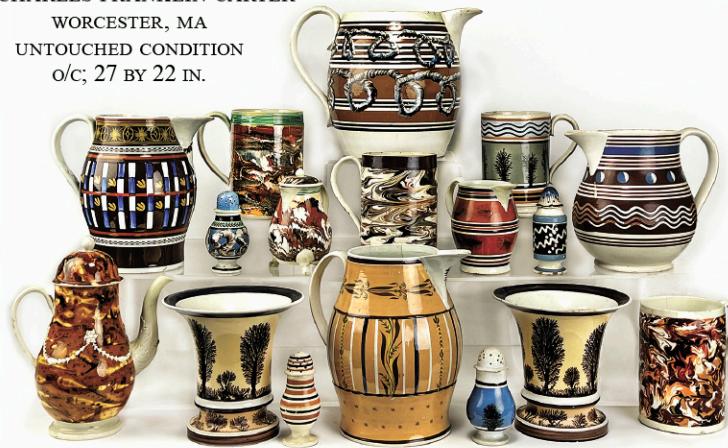
A PRIVATE COLLECTION OF MOCHAWARE (PARTIALLY SHOWN)