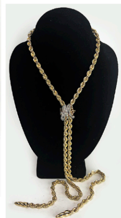
14K GOLD LARIAT NECKLACE, 208 GRAMS (OTHER JEWELRY TO BE SOLD)