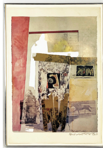
ROBERT RAUSCHENBERG (AMERICAN, 1925-2008) SCREEN PRINT DATED 1973 35 BY 24 IN.