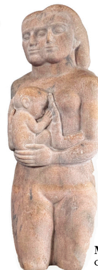
MORENON'S THE FUTURE GEORGIAN MARBLE, 48" EXHIBITED AT THE BOSTON MUSEUM OF FINE ARTS IN 1977