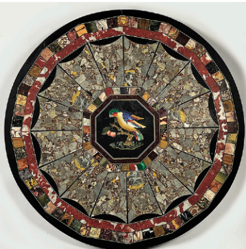
19TH C. ITALIAN PIETRA DURA, SPECIMEN AND MARBLE TABLE TOP, 28" DIAM.