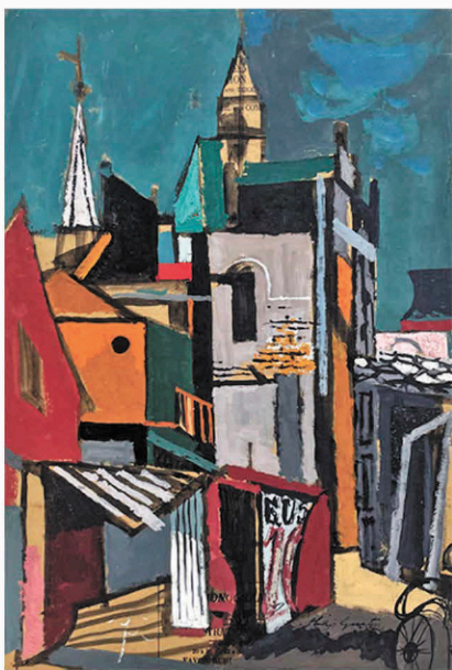
PHILIP GUSTON (1913 - 1980) Untitled - City Scene, 1946 Gouache on Board, 21.75" x 14.5"