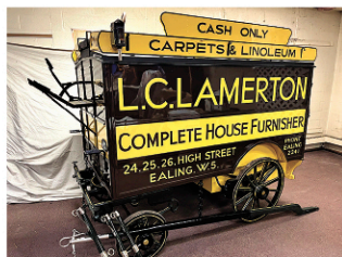
Pony Size Pantechon