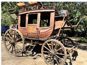
Abbott & Downing Stagecoach