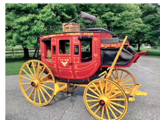
3/4 Size Stage Coach