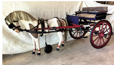
Early Original Childs Horse Pdeal Cart