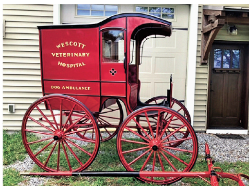
Wescott Dog Ambulance Made for Veterinarian from Portland Maine

ABSENTEE & PHONE BIDS (accepted to qualified buyers. Call the office for details prior to the sale date)