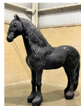
Life Size Fiberglass Friesian