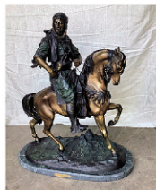
Bronze by A BARYE