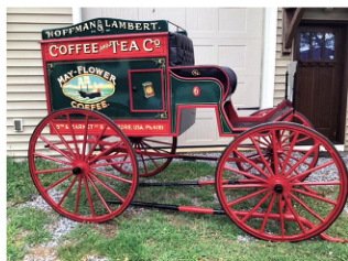
Coffee & Tea Peddler's Wagon