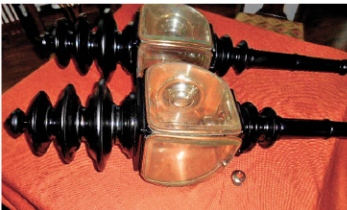
Unusual pair 38 coach lamps