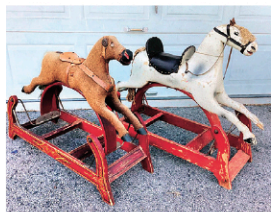
Antique Rocking Horses