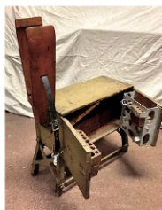
Field Sadler's Bench