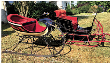
2 of 20 + Sleighs