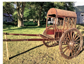
Chinese Wedding Carriage

Terms & Conditions or more information, call 717-354-6671, email: martinauctioneers@frontiernet.net or view our website: www.martinauctioneers.com . Martin Auctioneers has limited office hours. Please leave a voice message or send email. We are unable to guarantee correspondence via Facebook, messenger or text. To Register for online Auction. Please go to http://www.martinauctioneers.hibid.com . More individual pictures can be found at Hibid WHEN AVAILABLE. Onsite Purchases Buyer's Premium is 18% with a 3% Discount for Cash or Approved Check. Buyer's Premium for Online, Phone or Absentee Bid Purchases is 20% With a 3% Discount for Cash or Approved Check. ALL VEHICLES OR ITEMS SOLD AS IS, WHERE IS. Purchaser must understand he is buying property entirely upon his/her own examination. Buyers, please note: All purchases are your responsibility at the fall of the hammer. Payment Terms: CASH, VISA, Discover, Mastercard, Certified Check or Wire Transfer. Pennsylvania sales tax 6%. Dealers: Must provide a copy of your current Tax ID# or you will have to pay 6% sales tax. Wire transfers there will be fee of $50 applied to the invoice total. Please call 717-354-6671 for Wire Transfer instructions. All bids and payments in this sale will be made in United States Dollars. Checks accepted only with a Current Bank Letter of Guaranteed Payment, payable to Martin Auctioneers, Inc.