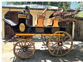
Horse Size Roof Seat Break