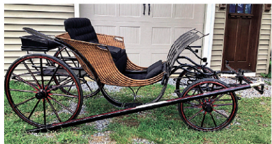
Wicker George IV Large Pony Size