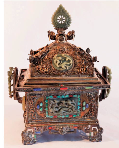
Rare Large Mongolian Silver Jade and Mixed Stone Lidded Box