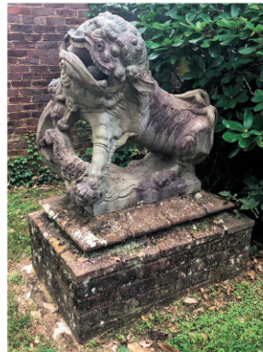
Brilliant Collection of Antique Garden Statuary & Sculptural Material