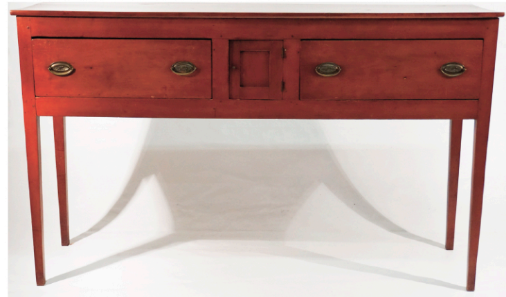
Fine Tennessee Federal Cherry Wood Huntboard