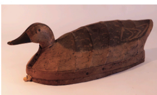
Large Collection of Maryland and NC Decoys