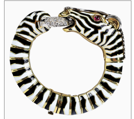
Fine estate jewelry including Katherine Jetter opal and rubellite ring, diamond platinum bracelet with 38ctw., Oscar Heyman diamond and sapphire ring with GIA, Frascarola 18kt. diamond and enamel zebra bracelet, classic diamond ring with 6ct, GIA, VS1, plus items by David Webb, Buccellati, Tiffany, Bulgari, Rolex, and Patek Philippe, over 250 lots