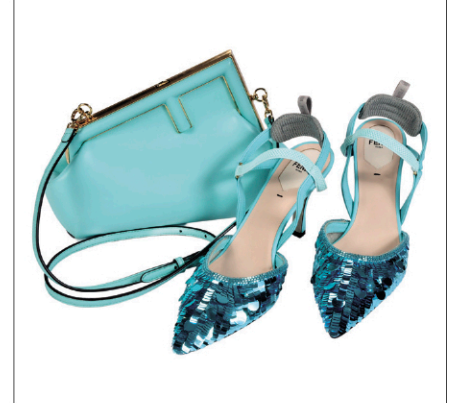
Designer handbags, clothing, and jewelry by LV, Gucci, Prada, Hermes includes a Berline, Chanel diamond bands, rare fashion books, and fine pens including a Pilot Namiki