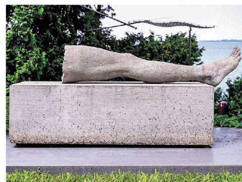
Erwin Wurm - A Fountain