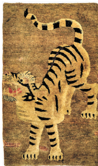
19th c Ningxia Tiger Area Rug