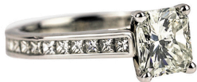
2.7 CT Diamond Platinum Ring