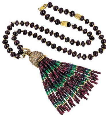
Ruby, Diamond, Sapphire, Emerald, Tassel Necklace