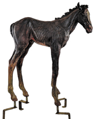
Joe Fafard "Pecos" 2003 - lifesize bronze foal, overall ht 61"