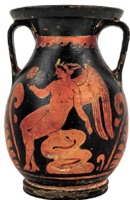
Ancient Greek Apulian Pelike vase