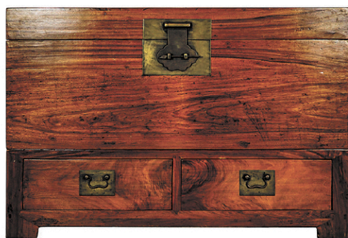
19th c Chinese Camphor Wood Chest on Chest