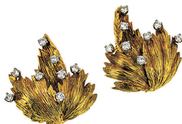
Raymond Yard 18k Diamond Earrings