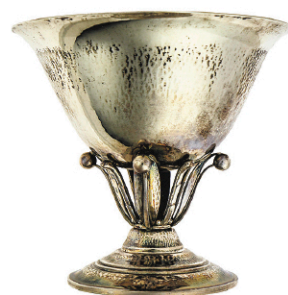
Georg Jensen Sterling