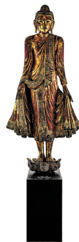
Antique Burmese Gilt Buddha, overall ht 71"