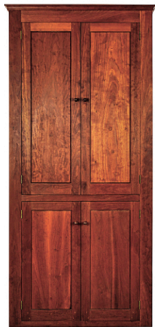
Thomas Moser Shaker Style Cupboard

MERRILL'S AUCTION GALLERY 137 JAMES BROWN DRIVE, WILLISTON, VERMONT