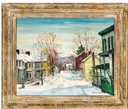
Walter Baum New Hope Street PA