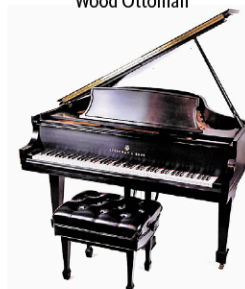
399: Steinway and Sons Ebony Piano and Bench