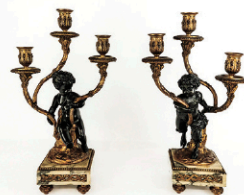
36: Pair of Companion Louis XV Bronze and Marble Candelabra