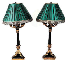
402: Pair French Empire Bronze Candelabra Lamps