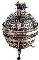
289: Spanish Colonial Coquera Vessel

150 School Street, Glen Cove, NY 11542 (2 Dosoris Way - for GPS)