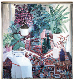
54: June OWEN Still Life with Antiquary Bottles Oil on Canvas