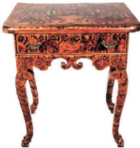
45: Dutch Baroque Inlaid Side Table