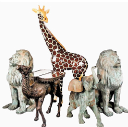
Lots 1 - 4