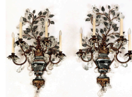
406: Pair of Bagues Manner Crystal Sconces