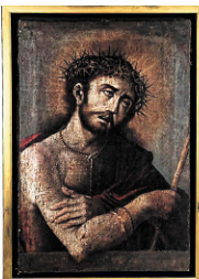
144: Ecce Homo Oil on Canvas