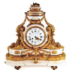
407: Louis XV Dore and Marble Palatial Mantel Clock