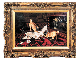
397: George HUGES Pugs at Play Oil Painting