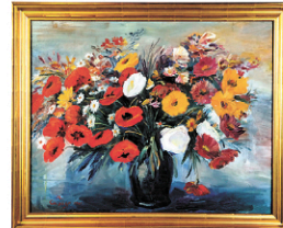
400: Martiros SARYAN, Floral Still Life, Oil on Canvas, 1961