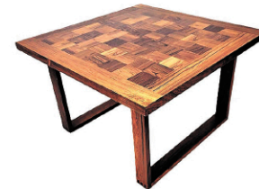
57: France & Son Mid-Century Modern Coffee Table