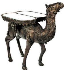
3: Bronze Camel Sculptural Cocktail Table