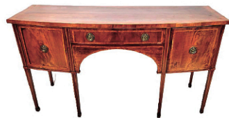
509: Regency Mahogany Sideboard