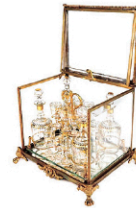
43: French Bronze Dore and Gilt Crystal Tantalus Set