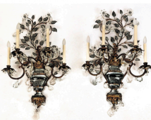
406: Pair of Bagues Manner Crystal Sconces