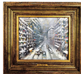
380: Guy WIGGINS Street Scene, Oil on Canvas