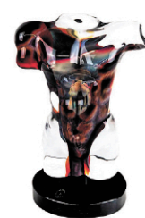
60: DINO ROSIN Adonis Murano Glass Sculpture