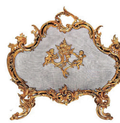
404: Louis XV Bronze Dore Fireplace Screen