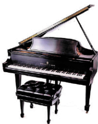
399: Steinway and Sons Ebony Piano and Bench