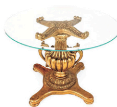
49: Classical Urn-Form Center Table