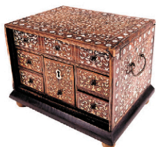
458: Inlaid Goanese Casket