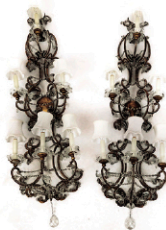
408: Pair of Bagues Manner Crystal and Glass Sconces