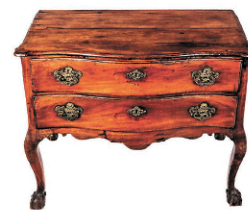
555: Portuguese Rococo Commode