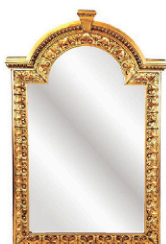
19: Palatial French Classical Giltwood Mirror