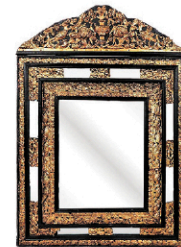
64: Flemish Baroque Mirror