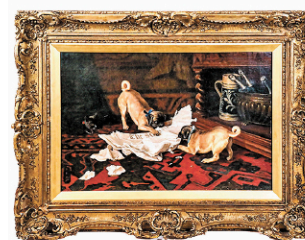
397: George HUGES Pugs at Play Oil Painting