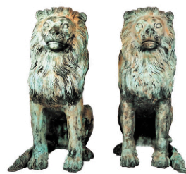
1: Pair of Monumental Bronze Verdigris Lion Statues