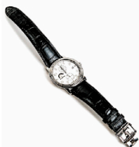
314: Blancpain Lemant Ltd. Edition Automatic Watch

150 School Street, Glen Cove, NY 11542 (2 Dosoris Way - for GPS)