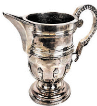
286: 19th C. German Silver Ewer