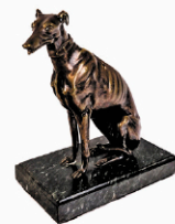
35: Art Deco Bronze Greyhound Desk Ornament