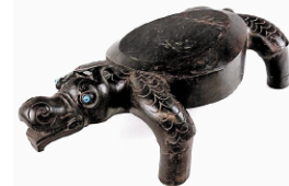
453: Indonesian Turtle Form Carved Wood Ottoman