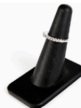
320: 14K White Gold and Diamond Ring