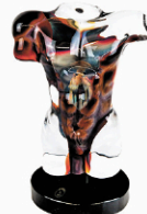
60: DINO ROSIN Adonis Murano Glass Sculpture