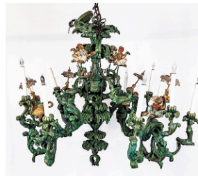
58: Venetian Rococo Chandelier with Carved Monkeys