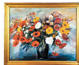
400: Martiros SARYAN, Floral Still Life, Oil on Canvas, 1961