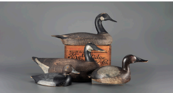
The George Secor Decoy Collection to Benefit Delta Waterfowl