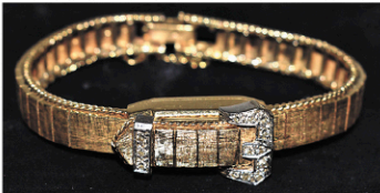
Gigandel 14kt Yellow/White Gold/Diamond Wrist Watch w/Buckle Form, C. 1940/50, w. 17.0 Dwt