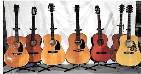
40+ Musical Instruments