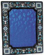
Russian Enameled Silver Dresser Frame, 19/20th C., 9" x 7"