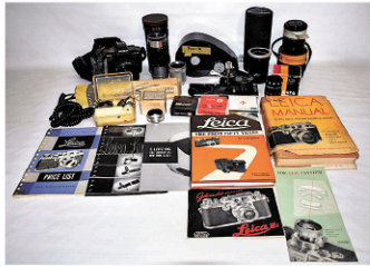
Lot Assorted Vintage incl. Leica Pamphlets, Lenses, etc.