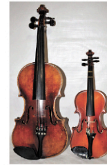
Lot (2) Vintage Student Model Violins incl. 1/8 Karl Hauser 4/4 Signed w/Paper Label, Illegible