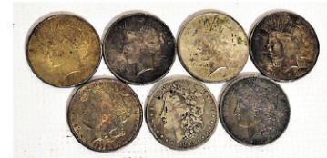
Lot (7) Assorted Morgan/Peace Silver Dollars, Morgans 1878-S, 1882-O, 1887; Peace 1922, 1923, (2) 1924