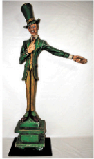
Rare Mad Hatter Jarvis Boone Carved/Painted Full Figure Floor Sculpture, C. 1960/70, H. 44 1/2"

Bid online through LiveAuctioneers • Phone/Absentee bidding available through EstateOfMind