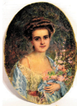
W/C Portrait Miniature Woman w/Flowers Signed Illegible, 19th C., 5 1/2" x 3 3/4"