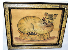
W/C Folk Art Cat in a Basket Unsigned, 19th C., 10" x 12"