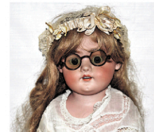
German Bisque Doll w/Sleep Eyes, Earring Holes & Teeth, Unmarked, 19/20th C., H. 28"

LOCATION: 195 Derby Road, Middletown, NY 10940 • CONTACT: (845) 386-4403 • EMAIL: estateofmind2009@yahoo.com