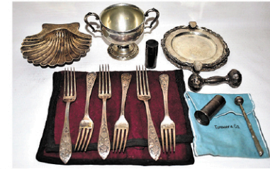
Lot Assorted Sterling, Tiffany Forks, Scent, etc., w. 27.4 oz