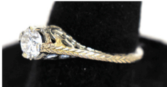
Lot (2) Art Deco 18kt White Gold/Diamond Rings, Size 6 3/4 & 8, w. 3.3 Dwt