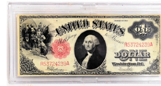
1917 U.S. One Dollar Large Note (Sawhorse Back) Near Unc.