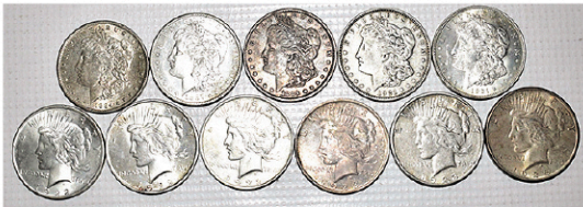
Lot (11) Assorted Silver Dollars incl. Morgan, Peace; Morgan - 1884-O, 1887-S, 1889-O, 1921, 1921-D; Peace - (3) 1922, (2) 1923, 1925