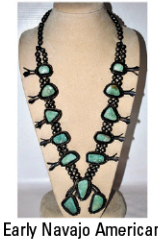
Early Navajo American Indian Sterling/Turquoise Squash Blossom Necklace, 19/20th C., L 28" (Old Pawn)