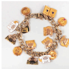
Gold Charm Bracelet 33.6 dwt.