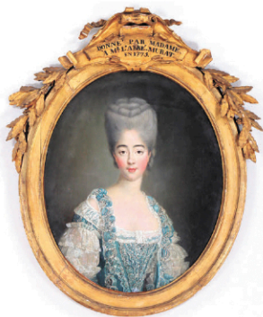
Follower of Francois-Hubert Drouais Canvas 28 x 23 in.

Register for direct online bidding - www.southbayauctions.com