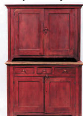
Stepback Cupboard 72 1/2 x 50 1/2 x 21 1/4 in. Prov. Jay St. Mark Estate