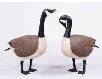
Pair of Life-Size Folk Art Canada Geese by Dominique Vienneotte, Canada.