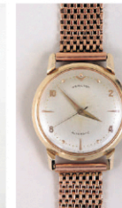
14k Hamilton Self-Winding. 41.8 dwt.