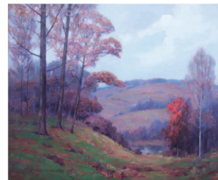
Francis Stillwell Dixon Canvas 25 x 30 in.