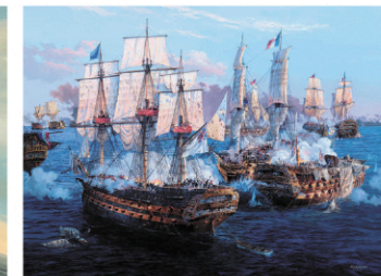
Tom Freeman Canvas 30 x 40 in.