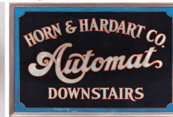
Horn & Hardart Co. Automat Sign Reverse-Painted. Frame 29 5/8 x 41 3/4 in.