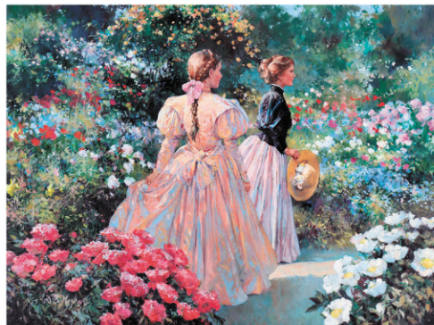
Dianne Flynn Canvas 30 x 40 in.