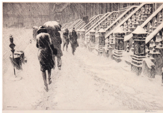
Martin Lewis "Stoops in Snow" drypoint. Plate 9 7/8 x 14 7/8 in.