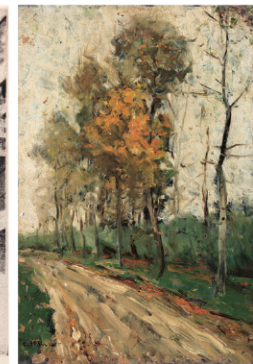
Chauncey Foster Ryder Panel 13 1/2 x 10 in.