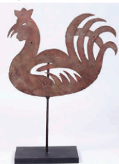
Rooster Weathervane Dutchess County, NY.