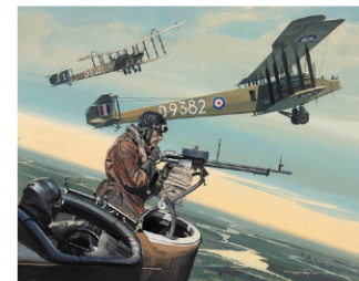
Thomas M. Hoyne Sight 13 1/2 x 17 1/2 in.