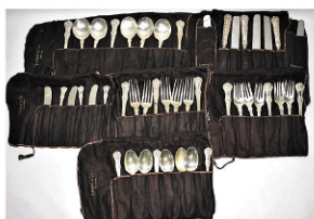
Service For (8) Tiffany & Co. Sterling Flatware, English Kings Pattern, (6) Pc. Place Setting, C. 1885, w. 75.2 oz.