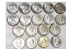
Lot (18) Assorted Walking Liberty/ Franklin/Kennedy Half Dollars, Walking Liberty- 1941-P, (2) 1941-D, (2) 1942-P, (4) 1943-P, 1945-D, (3) 1945-P, 1946-P; Franklin- (2) 1948-D, 1951-D; Kennedy- 1964-D