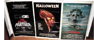
Lot (3) Vintage Horror Movie Posters incl. Halloween 1978, Death Ship 1980, The Silent Partner 1979, 41" x 27"