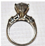
Exceptional Art Deco 14kt White Gold/Diamond Engagement Ring w/5.01 Ct Solitaire w/1 Ct Baguettes, Size 8 1/2, W. 5.4 Dwt