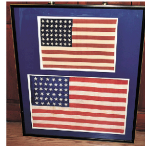
Fine (2) Vintage American Flag Display, (1) Flag Printed w/39 Stars Un-Official Parade Banner/Flag w/ 6-7-7-6-7-6 Pattern; Scarce 42 Star Large Parade Flag/Banner (Printed Silk Created To Celebrate State Of Washington/Statehood) 1889 & 1890, 12" x 17" & 15 1/2" x 24"

Bid online through LiveAuctioneers • Phone/Absentee bidding available through EstateOfMind