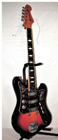
Rare Welson Super Jazz Electric Guitar w/Triple Welson Pick Ups & Super Jazz Tone Dials, C. 1970 (Tobacco Sunburst) (1 Of 40+ Musical Instruments)