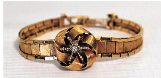
Lucien Piccard 14kt Yellow Gold/Diamond Ladies Evening Watch, C. 1950, L. 7", W. 17.2 Dwt