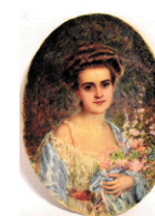
W/C Portrait Miniature Woman w/Flowers Signed Illegible, 19th C., 5 1/2" x 3 3/4"