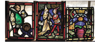
Lot (3) Fine Zettler Studios Stain Glass Window Panels incl. Romeo & Juliette, Monk w/Drink & Basket Of Flowers, 19/20th C., Largest 11 1/2" x 9"

LOCATION: 195 Derby Road, Middletown, NY 10940 • CONTACT: (845) 386-4403 • EMAIL: estateofmind2009@yahoo.com For additional photos & information, visit www.EstateOfMind.biz • www.LiveAuctioneers.com/Estate-of-Mind • www.AuctionZip.com , Auctioneer ID# 11093