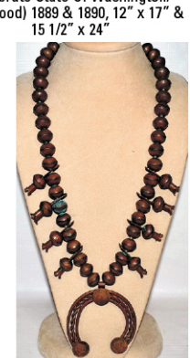
Rare Folk Art American Indian Squash Blossom Necklace w/all Early American Copper Indian Head & Lincoln Pennies, C. 1950'S, L. 24"