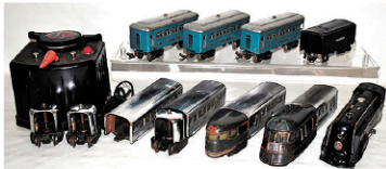
Lot Assorted Lionel Train Items incl. Bridges, C. 1920/30