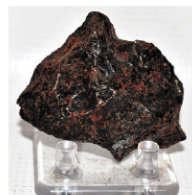
Campo Del Cielo Meteorite w/Document (Approx. 5500 Years Old)