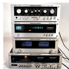
Set (3) Marantz Integrated Amp & Tuner Model # S 3200, 104, 140, C. 1960/70