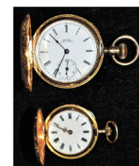
Lot (2) Victorian 18kt Yellow Gold Pocket Watches incl. Elgin, 19th C.