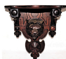
Victorian Black Forest Carved Wall Shelf w/Lion Head, 19th C., H. 11", W. 12"