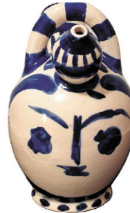
Pablo Picasso Ceramic