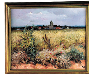
Marcel Dyf Landscape