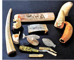
Large Collection of 19th Century Whale Artifacts