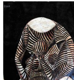
Post War Pablo Picasso