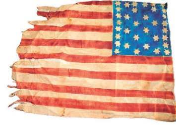
Homemade Civil War 34 Star Flag/ 24 Star Old Glory on Back 1861-3