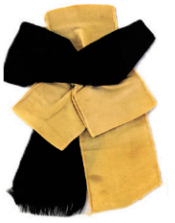
Abraham Lincoln 1864 Campaign Miniature with Mourning Ribbon and Provenance

NEW HAMPSHIRE AUCTIONS AND APPRAISALS, LLC WWW.NHAUCTIONSANDAPPRAISALS.COM