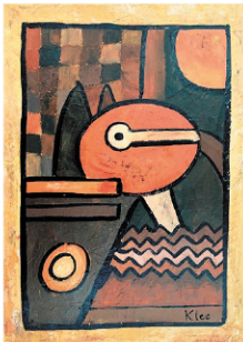
Paul Klee Oil Painting