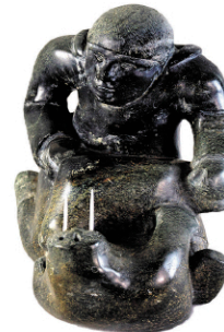
Large Inuit Sculpture