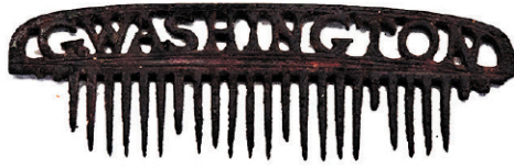
Early Federal Period Iron Washington Comb

Friday February 21 at 10am Previews February 20th 10am-4pm & by Appt