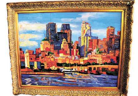
Armand Tatossian Montreal Cityscape