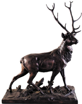
C. Paillet Bronze Stag