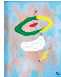
Joan Miro Oil Painting