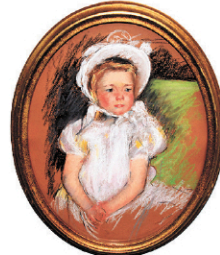
Portrait by Mary Cassatt