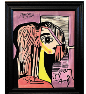
Pablo Picasso Watercolor

At auction will be 250 Lots to include several historical items from the 19th century, several lots of Fine Art most by listed artists, a collection of Pepi Herrmann crystal, luxury handbags, Napoleonic era ephemera, military items, folk art, Oriental rugs, collectibles and more.