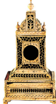
Scrimshaw Watch Hutch