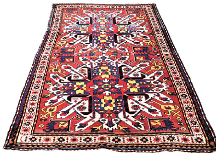
One of Several Oriental Rugs