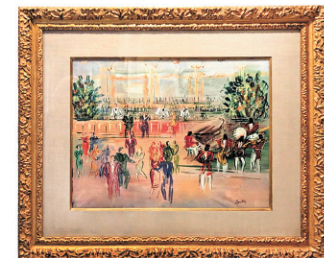
399: Jean Dufy, Watercolor Gouache, Au Cabaret