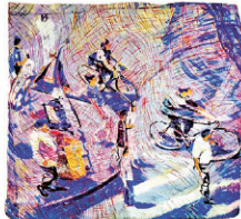
123: Juan GOMEZ-QUIROZ Figures on Bicycles - OB