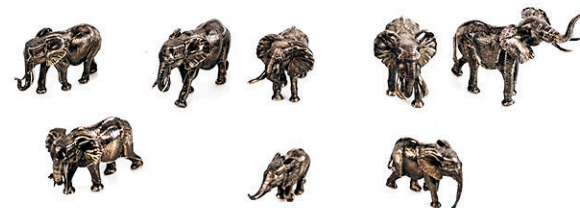
222: Patrick Mavros Eight Sterling Silver Elephants