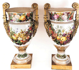
103: Sevres Important Pair of Palace Urns

150 School Street, Glen Cove, NY 11542 (2 Dosoris Way - for GPS)