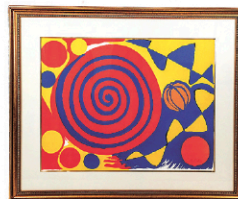
400: CALDER Untitled Swirl with Pumpkin Lithograph