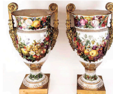
103: Sevres Important Pair of Palace Urns