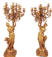
146: Pair of Louis XV Gilt Bronze Figural Candelabra