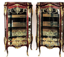
145: Pair of Louis XV Bronze and Satinwood Vitrines