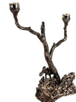
221: Patrick Mavros Sterling Silver Candelabrum