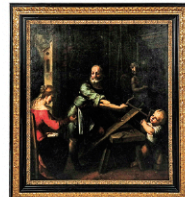
210: Old Master Holy Family Scene - Oil Painting