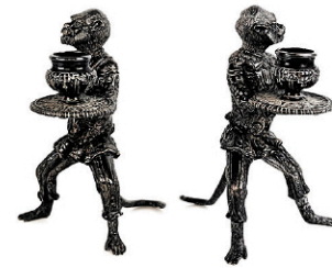
224: Tiffany & Co. Sterling Silver Monkey Candlesticks