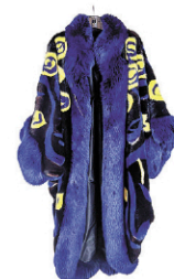
311: Christian Dior Dyed Mink and Fox Fur Coat