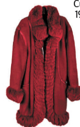
301: Christian Dior Shearling Jacket with Fox Fur Trim