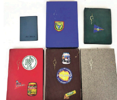
46: Large Collection of Antique Postage Stamps (100+)