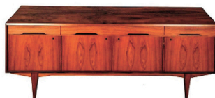
69: Gustav Bahus Mid-Century Modern Rosewood Credenza