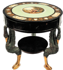
116: Empire Trompe l'Oeil Center Table