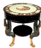
116: Louis XVI Chinoiserie Decorated Tilt Table