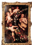
402: After TITIAN Venus With Mirror - Painting