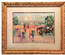
399: Jean Dufy, Watercolor Gouache, Au Cabaret