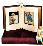
406: Baranger Studios Alice in Wonderland Automaton