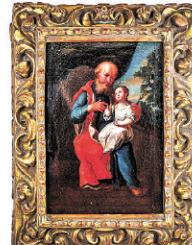
153: Joseph & Christ - Oil on Canvas Painting