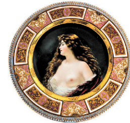
112: Royal Vienna Portrait Plate