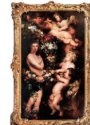
403: After BRUEGHEL or RUBENS Madonna - Painting