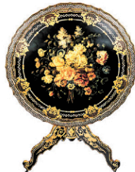
110: Louis XVI Chinoiserie Decorated Tilt Table