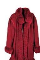
301: Christian Dior Shearling Jacket with Fox Fur Trim