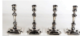
225: Tiffany & Co. Four Sterling Silver Candlesticks