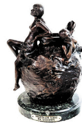
150: Emmanuel VILLANIS Bronze Sculpture