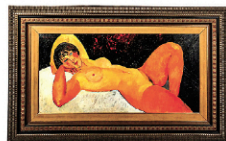
209: After Amedeo MODIGLIANI Le Grand Nu - OC