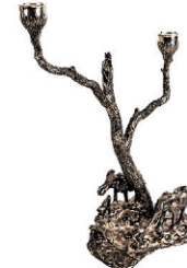
221: Patrick Mavros Sterling Silver Candelabrum