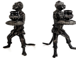
224: Tiffany & Co. Sterling Silver Monkey Candlesticks