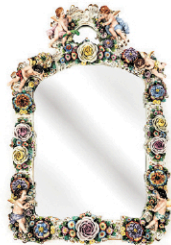
118: Dresden Porcelain Figural Mirror