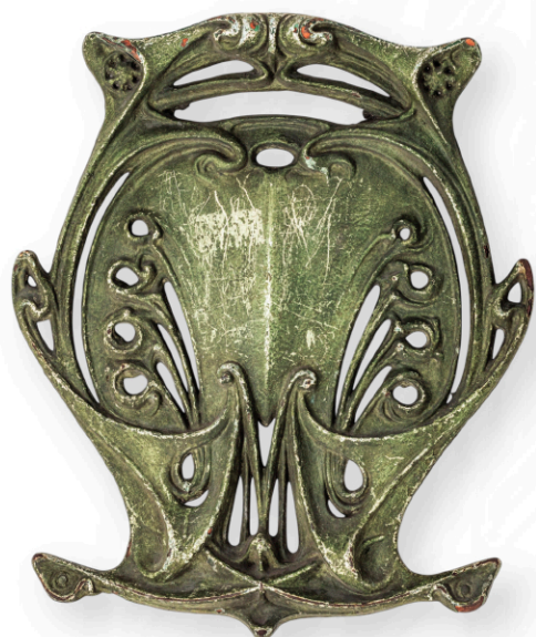
Hector Guimard (1867-1942) 1899-1904, 'Plaque For The Paris Metro'