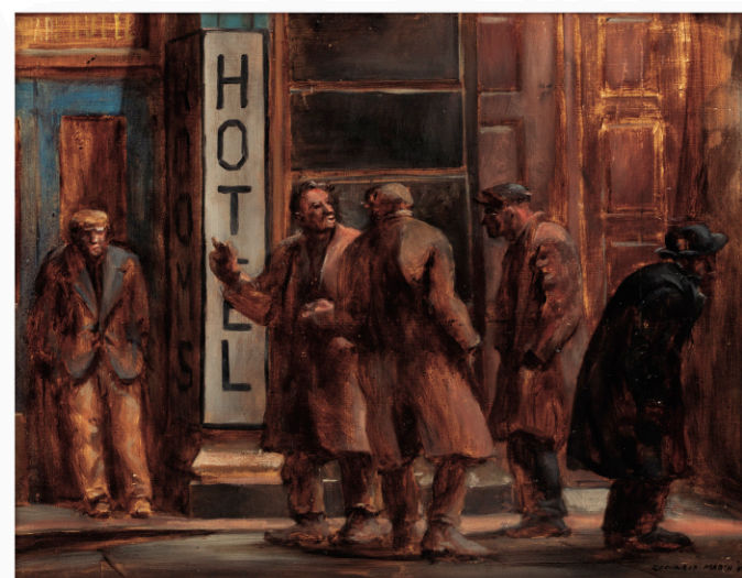
Reginald Marsh (1898-1954) 1941, 'Hotel'