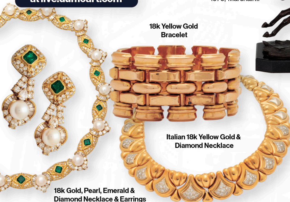
18k Gold, Pearl, Emerald & Diamond Necklace & Earrings