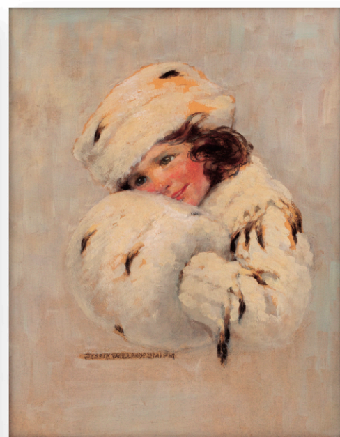
Jessie Wilcox Smith (1863-1935) 'Girl In White Fur Coat, Hat And Muff' (February 1925 Good Housekeeping Cover)