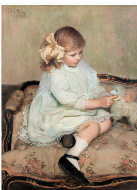
Lila Cabot Perry (1848-1933) 'Mary And Her Little Lamb', 1880-1910