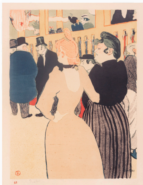
Henri De Toulouse-Lautrec (1864-1901) 'Au Moulin Rouge'