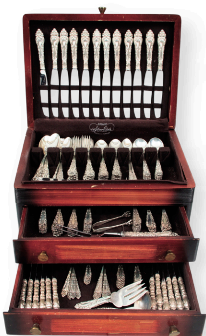
Amston "Athene" Sterling Silver Dinner & Luncheon Set 1950, 152 Pcs.