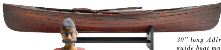
30" long Adirondack guide boat model