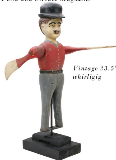
Vintage 23.5" tall whirligig