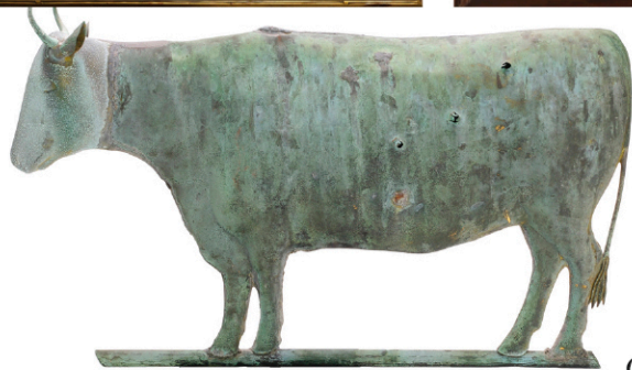
Cow weathervane attributed to Cushing and Company Boston