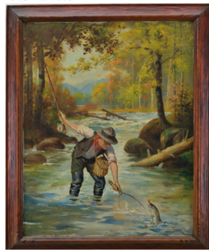
Oil on canvas by Oliver Kemp, 29.5" x 23.5"