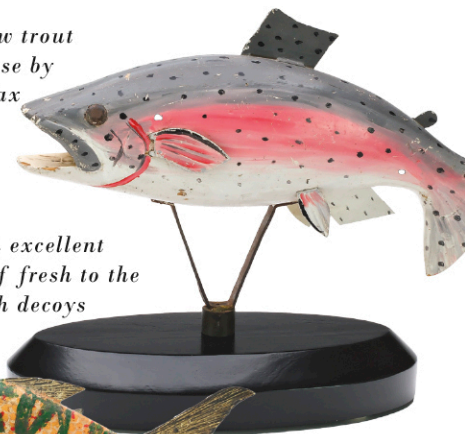
Part of an excellent selection of fresh to the market fish decoys