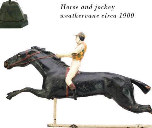
Horse and jockey weathervane circa 1900