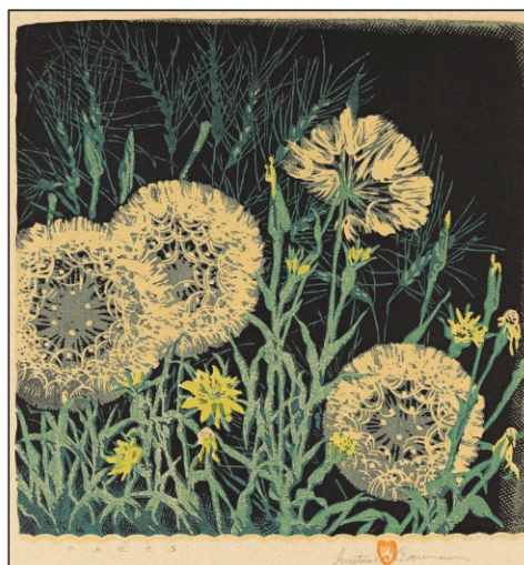
Gustave Baumann, Tares , color woodcut, 1952. $5,000 to $8,000. At auction April 15.