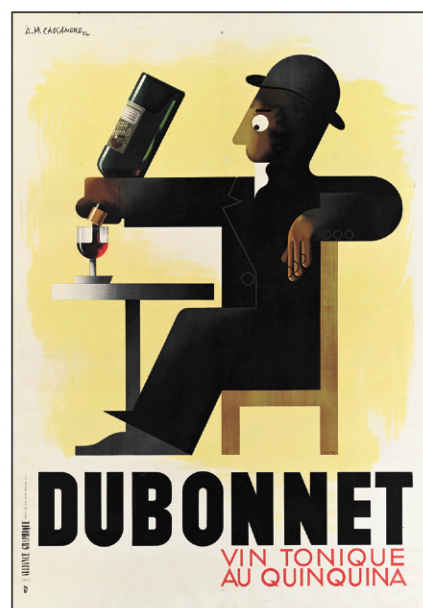
Adolphe Mouron Cassandre, Dubo, Dubon, Dubonnet , triptych, 1932. $400,000 to $600,000. At auction April 24